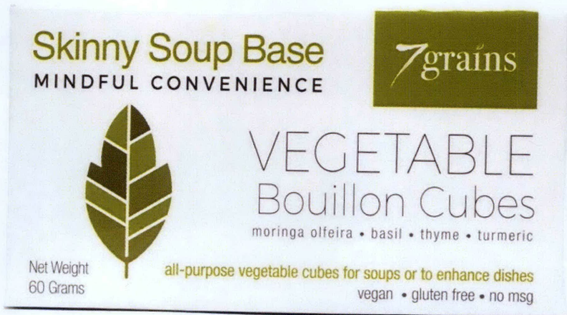
Figure 1. Unregistered 7GRAINS Vegetable Bouillon Cubes, 60g

The Food and Drug Administration (FDA) warns the public from purchasing and consuming the following unregistered food products: