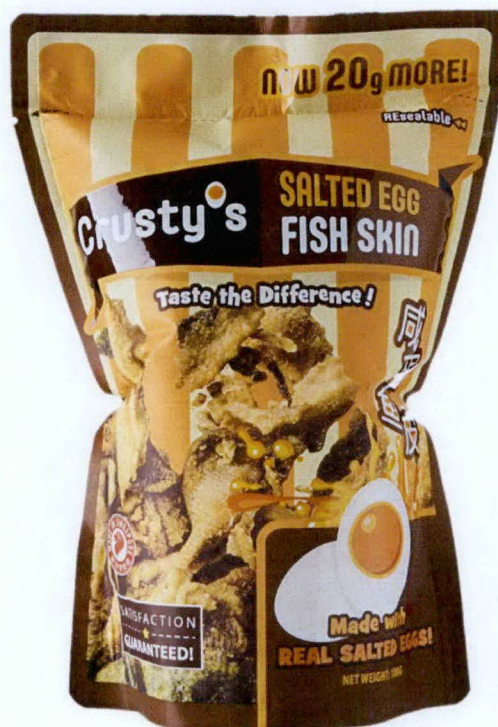
Figure 4. Unregistered CRUSTY'S Salted Egg Fish Skin