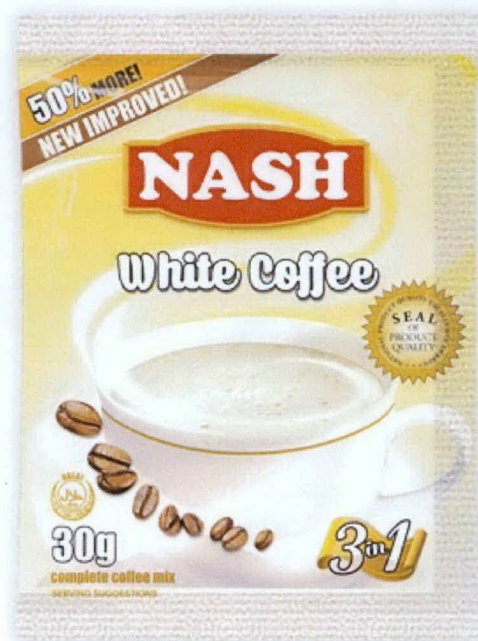
Figure 5. Unregistered NASH White Coffee 3in1, 30g