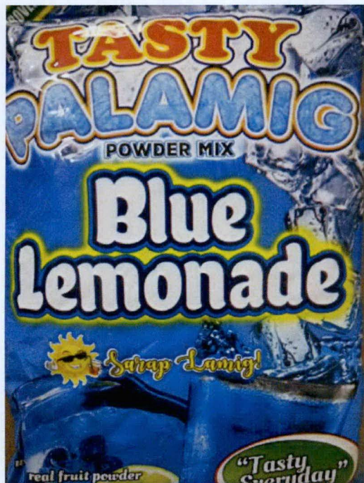
Figure 4. Unregistered TASTY PALAMIG Powder Mix Blue Lemonade, 500g