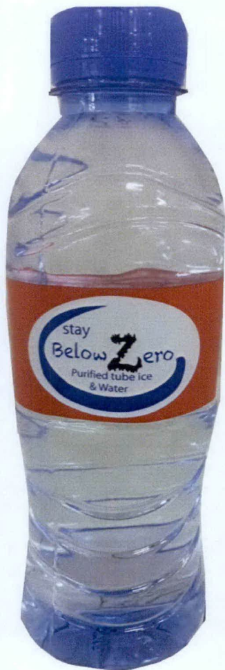
Figure 2. Unregistered STAY BELOW ZERO Purified Tube Ice & Water, 350ml