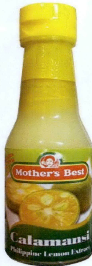
Figure 3. Unregistered MOTHER'SBEST Calamansi Philippine Lemon Extract, 150ml