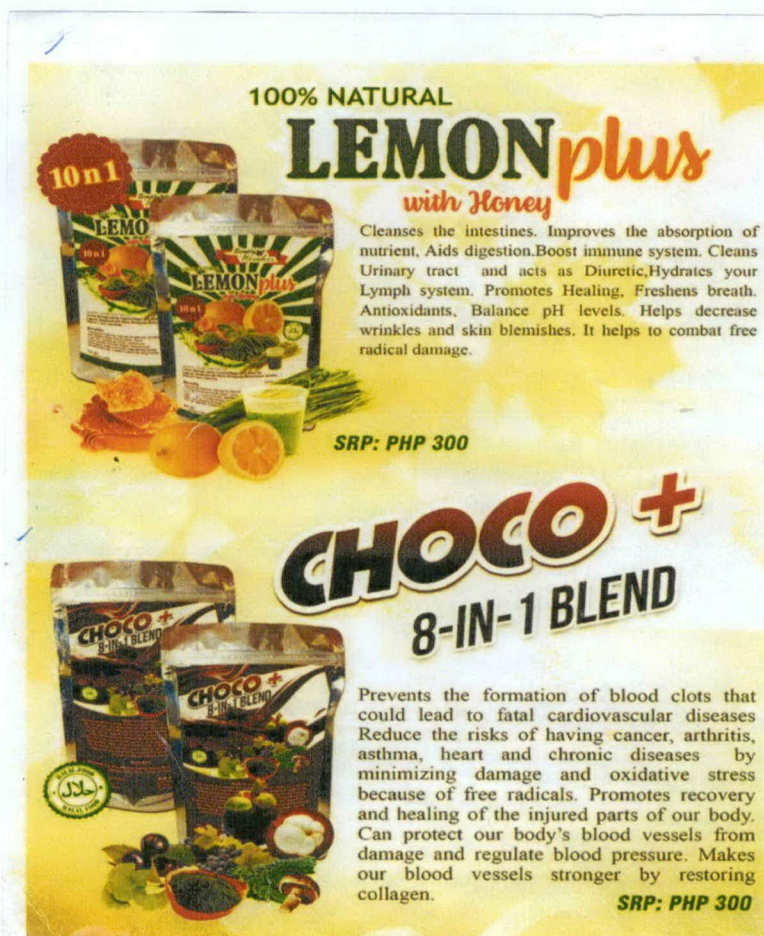
Figure 1. Sample Brochure of Unregistered SIMPLY WONDERS Lemon Plus with Honey and Choco + 8-in-1 Blend

The Food and Drug Administration (FDA) warns the public from purchasing and consuming the following unregistered food products with unapproved advertisements and promotions: