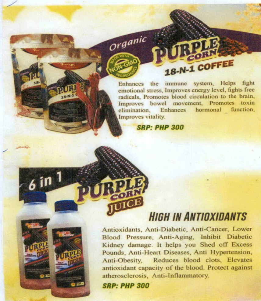
Figure 2. Sample Brochure of Unregistered SIMPLY WONDERS Purple Corn 18-n-1 Coffee and Purple Corn Juice 6 in 1

The FDA verified through post-marketing surveillance that the abovementioned food products are not registered and the Certificate of Product Registration (CPR) have not yet been issued. Pursuant to the Republic Act No. 9711, otherwise known as the "Food and Drug Administration Act of 2009", the manufacture, importation, exportation, sale, offering for sale, distribution, transfer, non-consumer use, promotion, advertising or sponsorship of health products without the proper authorization is prohibited.