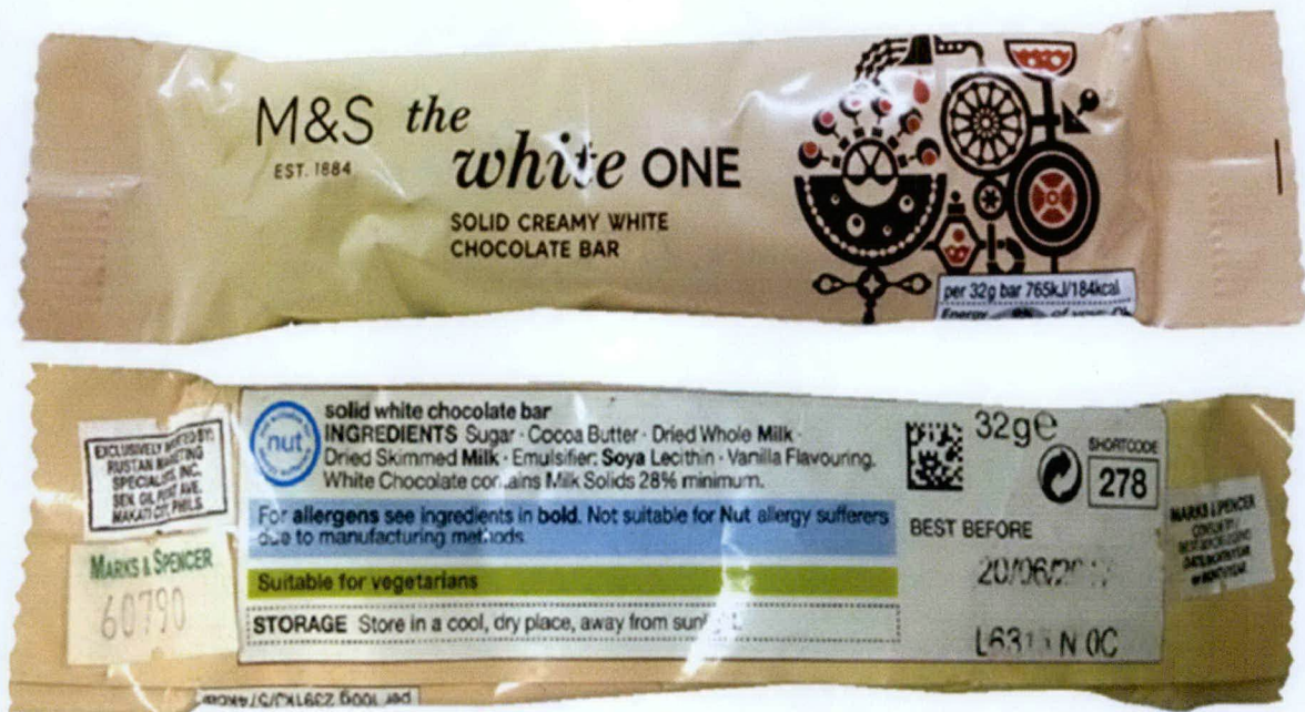
Figure 1. M&S (Marks & Spencer) The White One Chocolate Bar, with Registration Number FR-4000002583138

The Food and Drug Administration (FDA) informs the public that the food product has been registered by the Market Authorization Holder (MAH), RUSTAN MARKETING SPECIALIST, INC., in accordance to existing FDA rules and regulations: