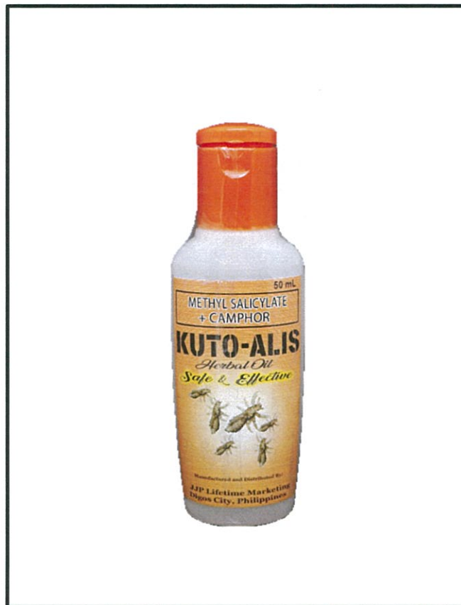
Figure 2. Unregistered METHYL SALICYLATE+CAMPHOR KUTO-ALIS Herbal Oil 50 mL

The FDA has verified through post-marketing surveillance that the abovementioned drug products are not registered and no Certificates of Product Registration (CPR) have been issued. Pursuant to the Republic Act No. 9711, otherwise known as “Food and Drug Administration Act of 2009”, the manufacture, importation, exportation, sale, offering for sale, distribution, transfer, non-consumer use, promotion, advertising or sponsorship of these health products without the proper authorization is prohibited.