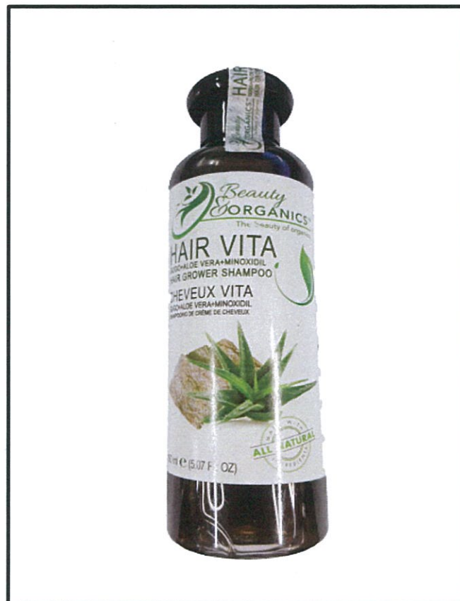
Figure 1. Unregistered Beauty Organics™ HAIR VITA (Gugo+Aloe Vera+Minoxidil) HAIR GROWER SHAMPOO 150 mL

The Food and Drug Administration (FDA) warns the public against the purchase and use of the following unregistered drug products: