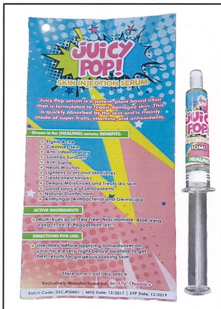
Figure 1. Unregistered Product: Juicy Pop! Skin Injection Serum

The Food and Drug Administration (FDA) warns the public from purchasing and using the following unregistered drug product: