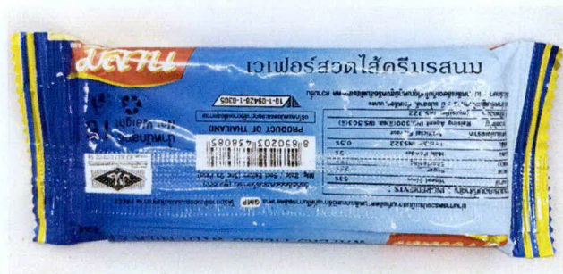
Figure 4. Unregistered MILAN Wafers Filled with Milk Cream