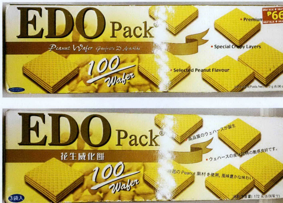
Figure 1. Unregistered EDO PACK Peanut Wafer

The Food and Drug Administration (FDA) advises the public from purchasing and consuming the following unregistered food products and food supplement: