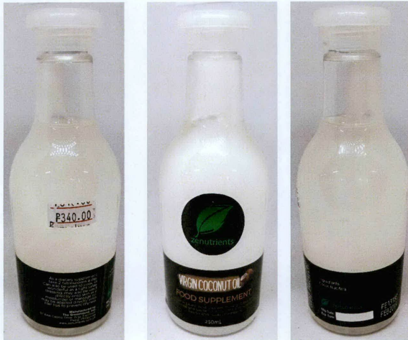
Figure 6. Unregistered ZENUTRIENTS Virgin Coconut Oil Food Supplement

The FDA verified through post-marketing surveillance that the abovementioned food products and food supplement are not authorized and the Certificates of Product Registration (CPR) have not been issued. Pursuant to the Republic Act No. 9711, otherwise known as the “Food and Drug Administration Act of 2009”, the manufacture, importation, exportation, sale, offering for sale, distribution, transfer, non-consumer use, promotion, advertising or sponsorship of health products without the proper authorization is prohibited.