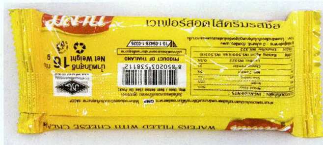
Figure 5. Unregistered MILAN Wafers Filled with Cheese Cream