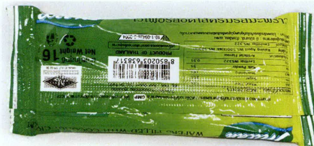
Figure 3. Unregistered MILAN Wafers Filled with Coconut Cream