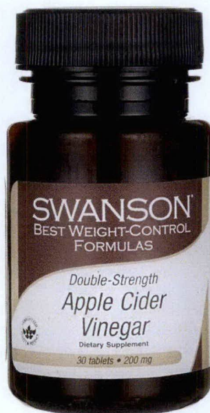
Figure 5. Unregistered SWANSON Double-Strength Apple Cider Vinegar Dietary Supplement

The FDA verified through post-marketing surveillance that the abovementioned food products and food supplements are not authorized and the Certificates of Product Registration (CPR) have not been issued. Pursuant to the Republic Act No. 9711, otherwise known as the "Food and Drug Administration Act of 2009", the manufacture, importation, exportation, sale, offering for sale, distribution, transfer, non-consumer use, promotion, advertising or sponsorship of health products without the proper authorization is prohibited.