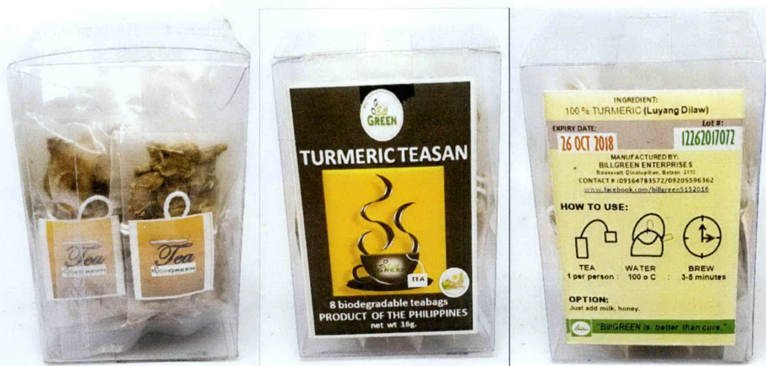
Figure 2. Unregistered BILL GREEN Termeric Teasan