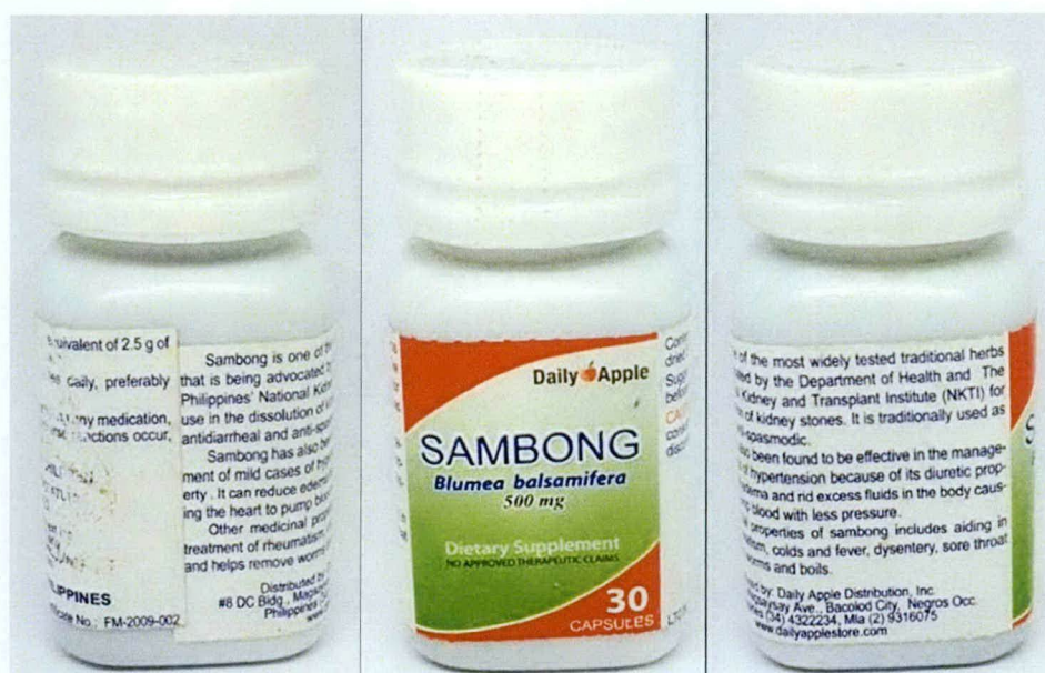
Figure 3. Unregistered DAILY APPLE Sambong Blumea balsamifera Dietary Supplement