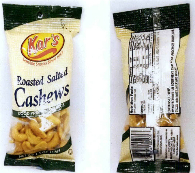
Figure 4. Unregistered KAR'S Roasted Salted Cashew