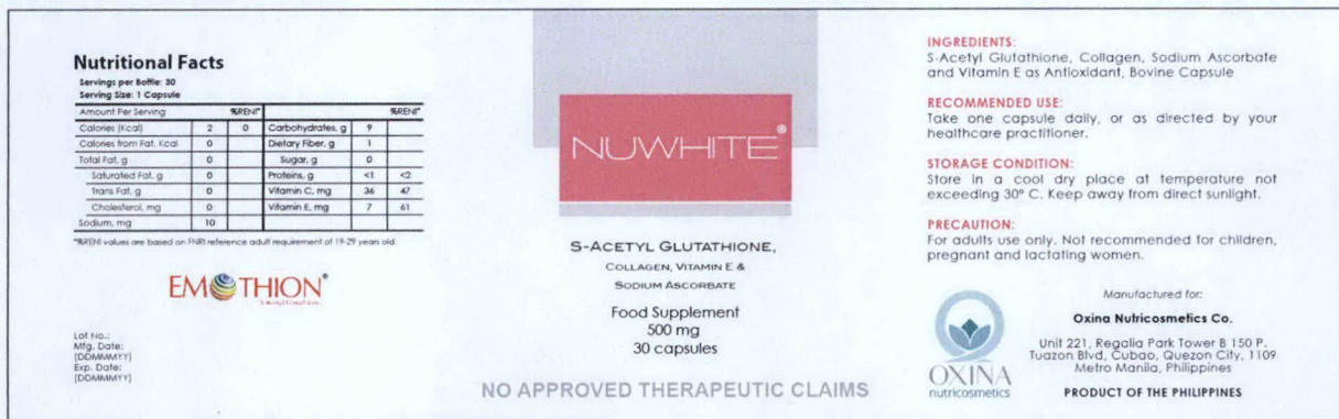
Figure 1. Approved label of NUWHITE PREMIUM Glutathione, Collagen & Vitamin E Food Supplement Capsule with registration number FR-4000002667665 valid until 23 January 2021

The Food and Drug Administration (FDA) informs the public that the food supplement NUWHITE PREMIUM Glutathione, Collagen & Vitamin E Food Supplement Capsule has been registered by the Market Authorization Holder, OXINA NUTRICOSMETICS CO. , in accordance to existing FDA rules and regulations.