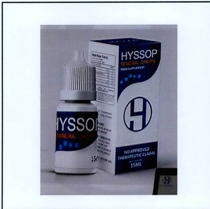
Figure 1. Unregistered Product: HYSSOP Mineral Drops 15 mL

The Food and Drug Administration (FDA) warns the public from purchasing and using the following unregistered drug product: