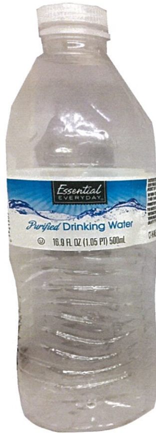
Figure 3. Unregistered ESSENTIAL EVERYDAY Purified Drinking Water