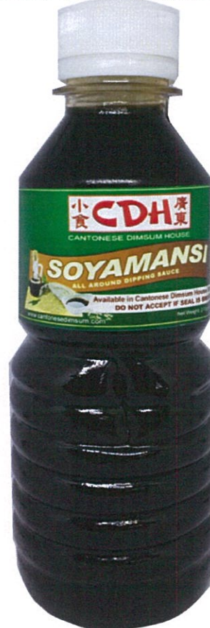
Figure 5. Unregistered CDH Cantonese Dimsum House Soyamansi