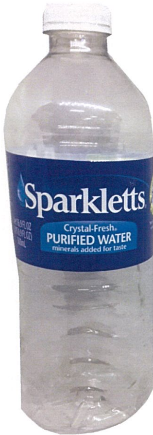
Figure 2. Unregistered SPARKLETTS Purified Water