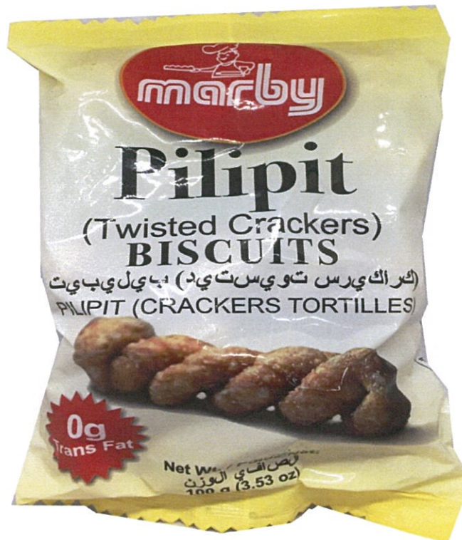
Figure 1. Unregistered MARBY Pilipit (Twisted Crackers) Biscuits

The Food and Drug Administration (FDA) warns the public from purchasing and consumption of the following unregistered food products: