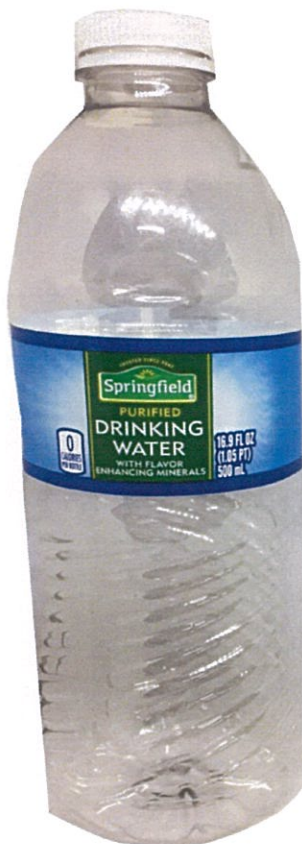
Figure 4. Unregistered SPRINGFIELD Purified Drinking Water