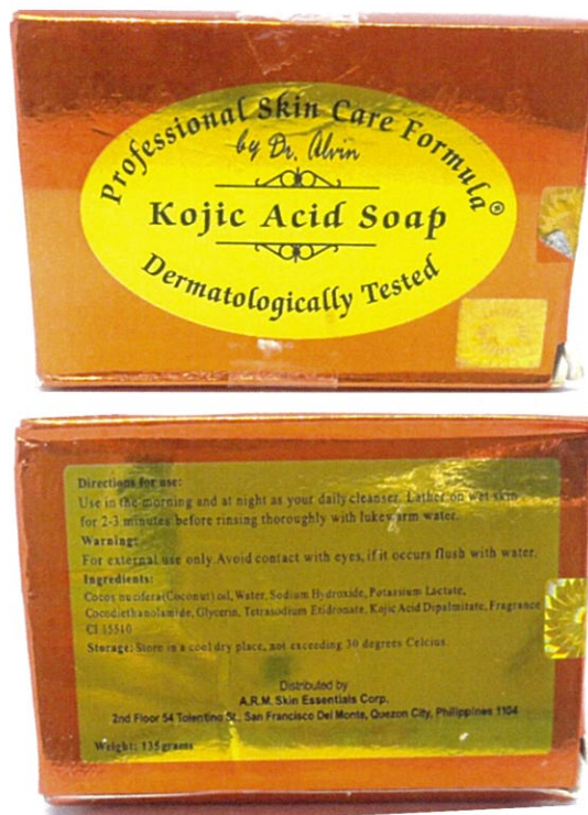
Figure 1. Unnotified Professional Skin Care Formula® by Dr. Alvin Kojic Acid Soap

The Food and Drug Administration (FDA) warns the public from purchasing and using the following unnotified cosmetic products: