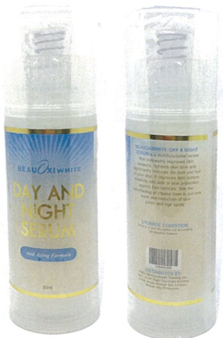
Figure 4. Unnotified Beauxiwhite Day and Night Serum Anti-Aging Formula