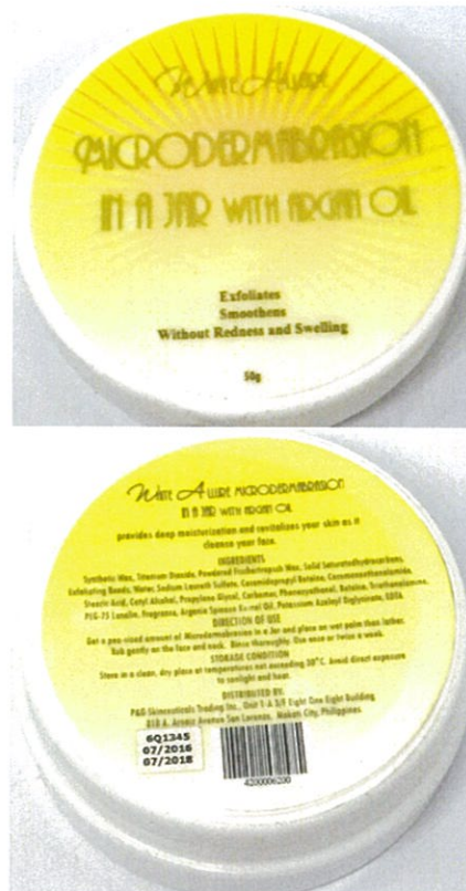
Figure 3. Unnotified White Allure Microdermabrasion with Argan Oil