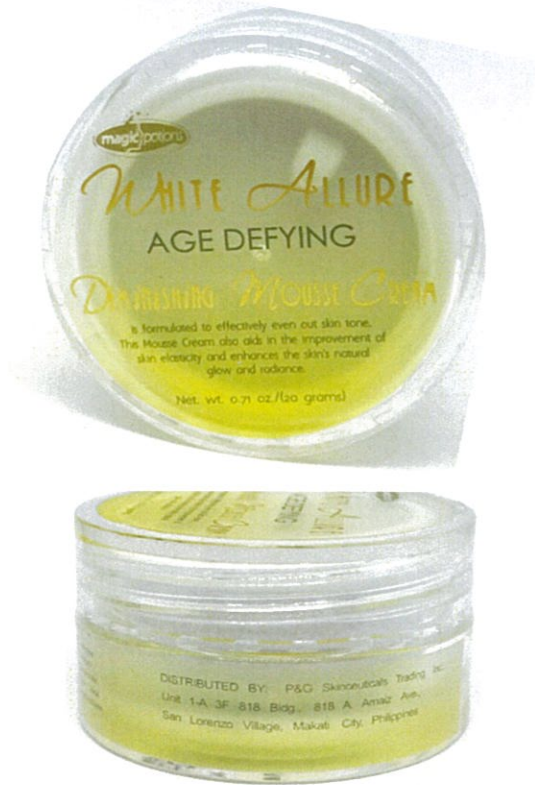
Figure 2. Unnotified Magic Potions White Allure Age Defying Diminishing Mousse Cream