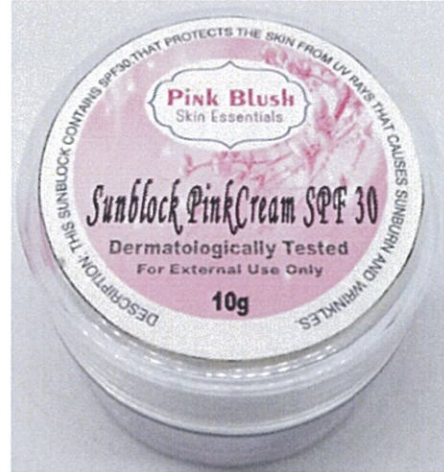
Figure 2.2. Unnotified Pink Blush Skin Essentials Set: Sunblock Pink Cream SPF 30