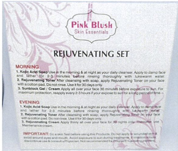
Figure 2. Unnotified Pink Blush Skin Essentials Set