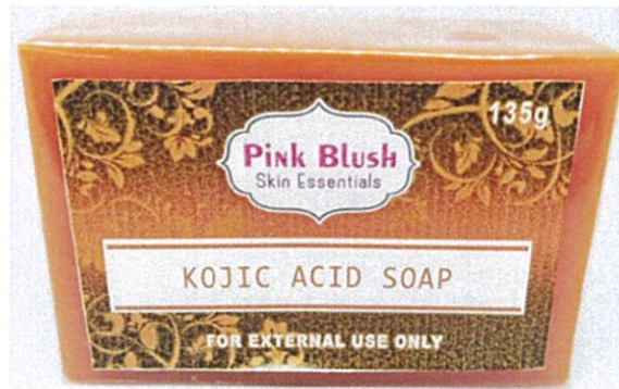
Figure 2.4 Unnotified Pink Blush Skin Essentials Set: Kojic Acid Soap