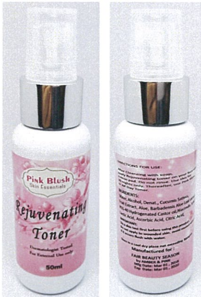
Figure 2.3 Unnotified Pink Blush Skin Essentials Set: Rejuvenating Toner