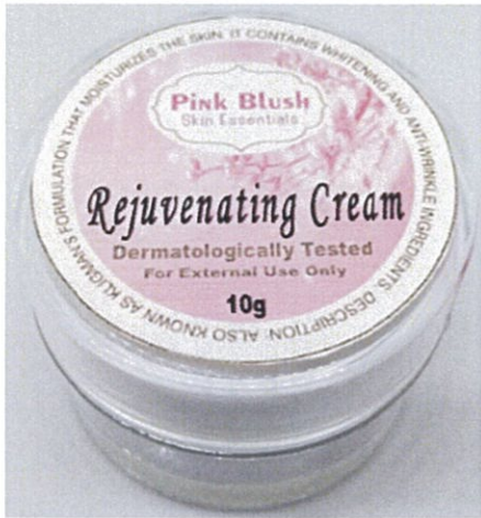
Figure 2.1. Unnotified Pink Blush Skin Essentials Set: Rejuvenating Cream