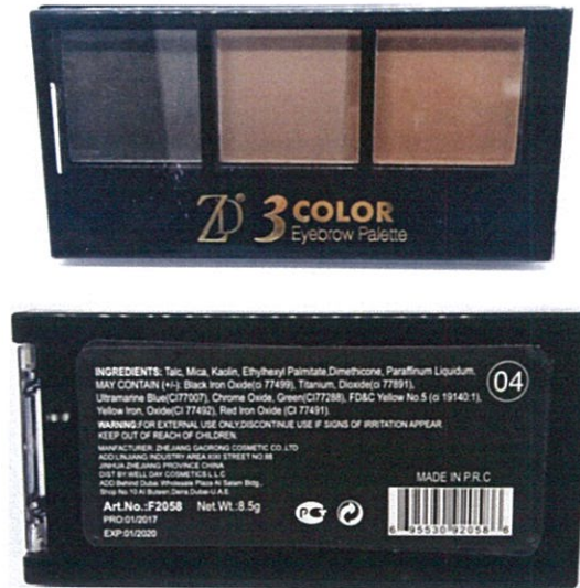
Figure 3. Unnotified ZD® 3 Color Eyebrow Palette (04)