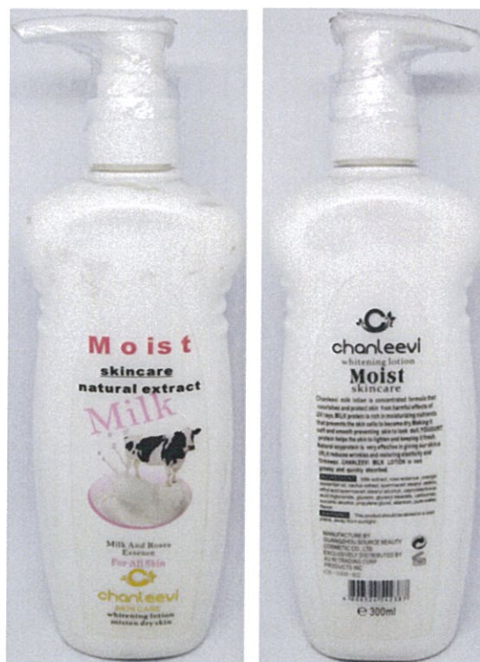
Figure 1. Unnotified Chanleevi Whitening Lotion Moist Skincare Natural Extract Milk and Rose Essence

The Food and Drug Administration (FDA) warns the public from purchasing and using the following unnotified cosmetic products: