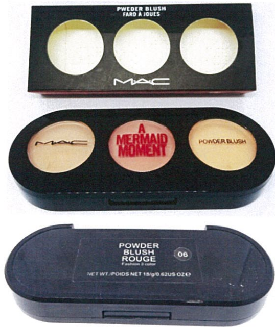
Figure 2. Unnotified M·A·C. A Mermaid Moment Powder Blush (Rouge 06)