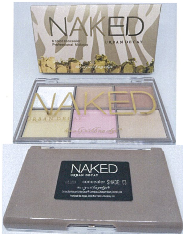
Figure 4. Unnotified Naked Urban Decay 6 Color Concealer Professional Makeup (Shade 03)