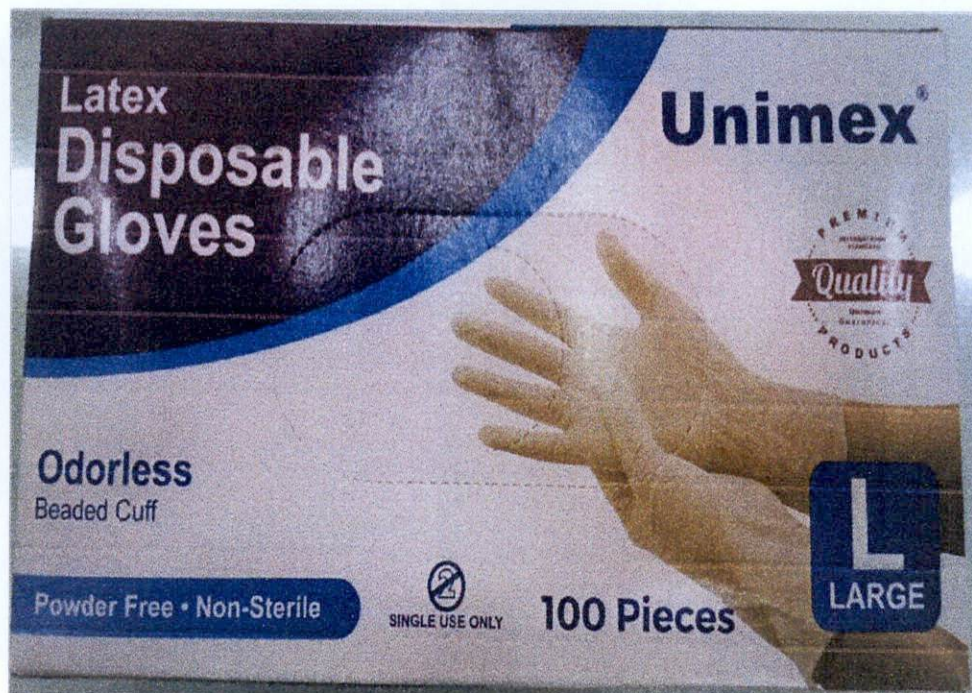
Figure 1. Unregistered Unimex® Latex Disposable Gloves

The Food and Drug Administration (FDA) warns all healthcare professionals and the general public against the purchase and use of the unregistered medical device: