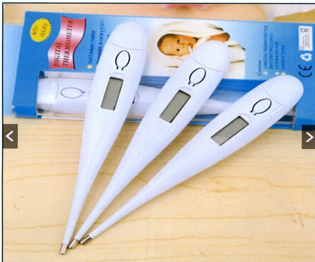
Figure 1. Arturo Fixotherm SP-FT-001 Digital Fever Thermometer

The Food and Drug Administration (FDA) warns all concerned healthcare professionals and the public against the purchase and use of this unregistered medical device (see photos below):