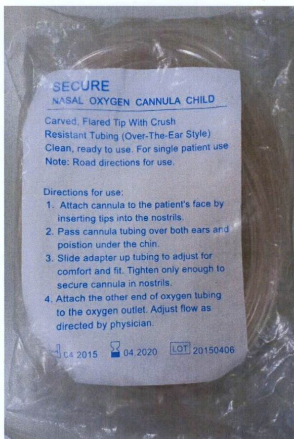
Figure 1. Unregistered Secure Nasal Oxygen Cannula Child

The Food and Drug Administration (FDA) warns all healthcare professionals and the general public against the purchase and use of the unregistered medical device: