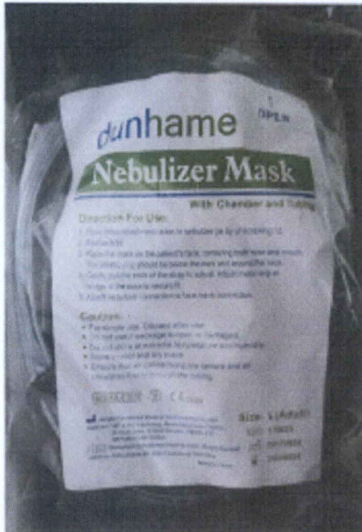
Figure 1. Unregistered Dunhame Nebulizer Mask with Chamber and Tubing

The Food and Drug Administration (FDA) warns all healthcare professionals and the general public against the purchase and use of the unregistered medical device: