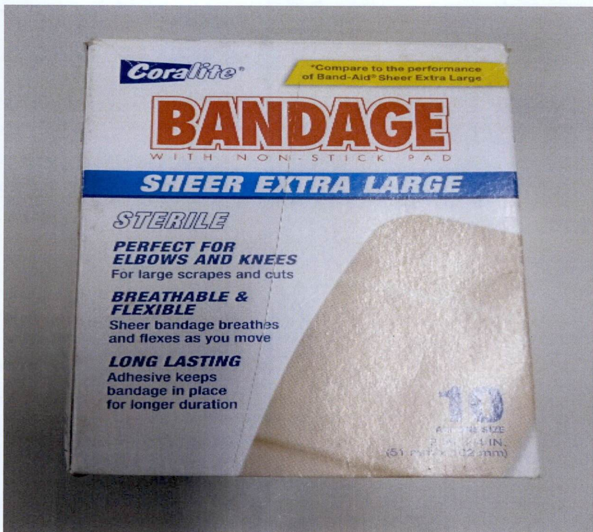
Figure 1. Unregistered Coralite Bandage with Non-Stick Pad

The Food and Drug Administration (FDA) warns all concerned healthcare professionals and the public against the purchase and use of the unregistered medical device: