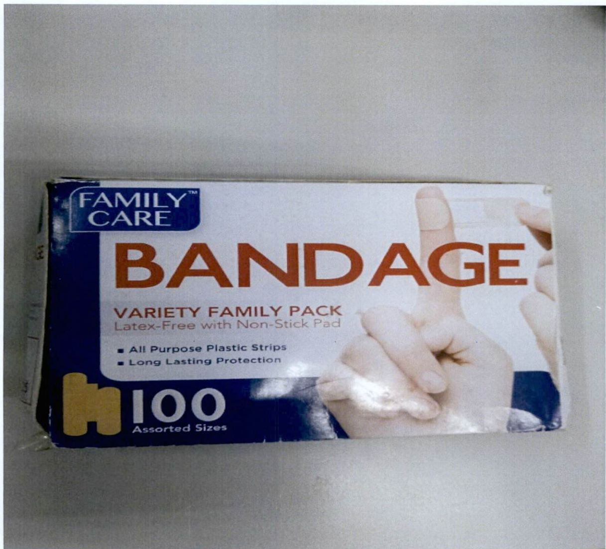
Figure 1. Unregistered Family Care Bandage

The Food and Drug Administration (FDA) warns all concerned healthcare professionals and the public against the purchase and use of this unregistered medical device (see photos below):