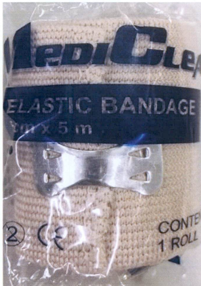
Figure 1. Unregistered Mediclean Elastic Bandage

The Food and Drug Administration (FDA) warns all healthcare professionals and the general public against the purchase and use of the unregistered medical device: