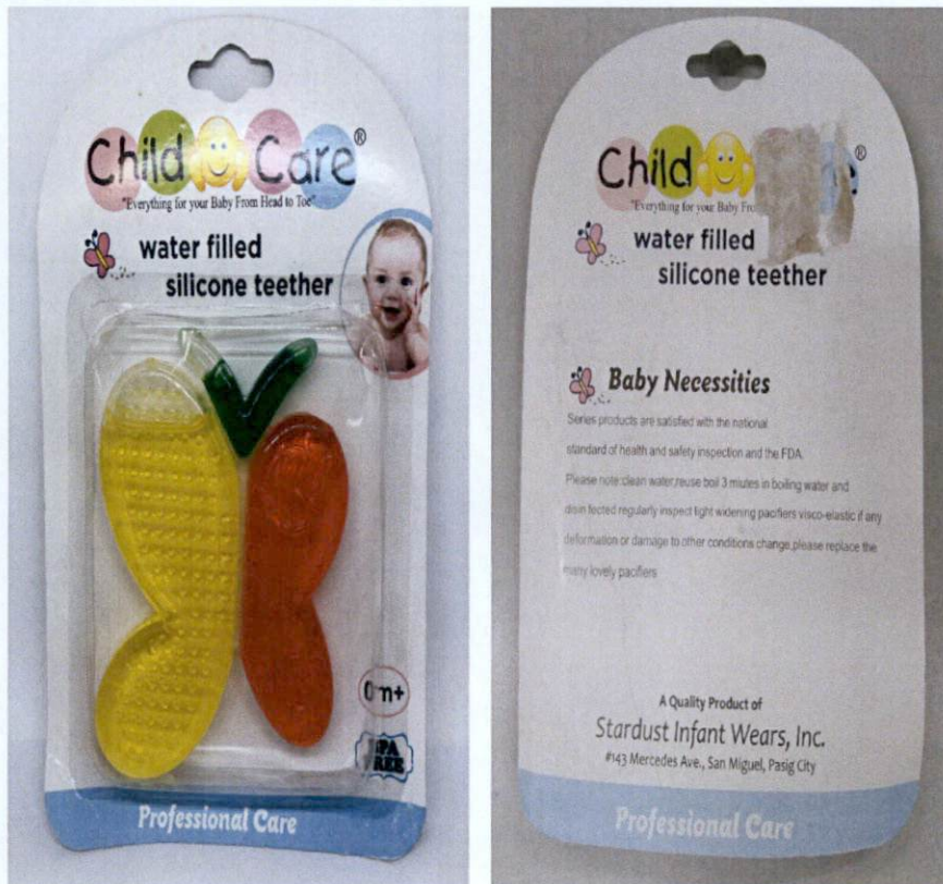
Figure 1. Unnotified Child Care Water Filled Silicone Teether

The Food and Drug Administration (FDA) warns the public from purchasing and using the following Unnotified TCCAs: