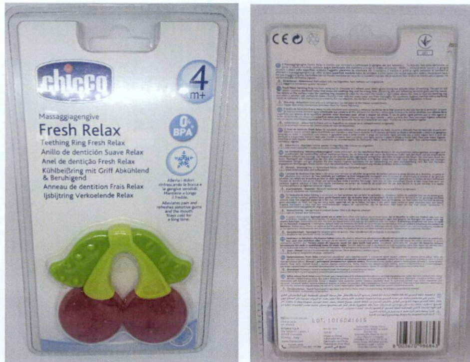
Figure 4. Unnotified Chicco Fresh Relax Teething Ring

The FDA verified through post-marketing surveillance that the abovementioned TCCA products are not authorized and the Certificates of Product Notification (CPN) have not been issued. Pursuant to the Republic Act No. 9711, otherwise known as the “Food and Drug Administration Act of 2009”, the manufacture, importation, exportation, sale, offering for sale, distribution, transfer, non-consumer use, promotion, advertising or sponsorship of health products without the proper authorization is prohibited.