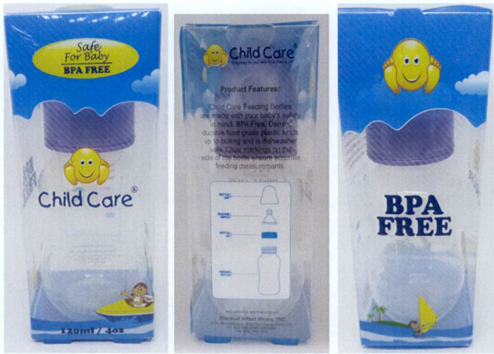
Figure 2. Unnotified Child Care Feeding Bottle