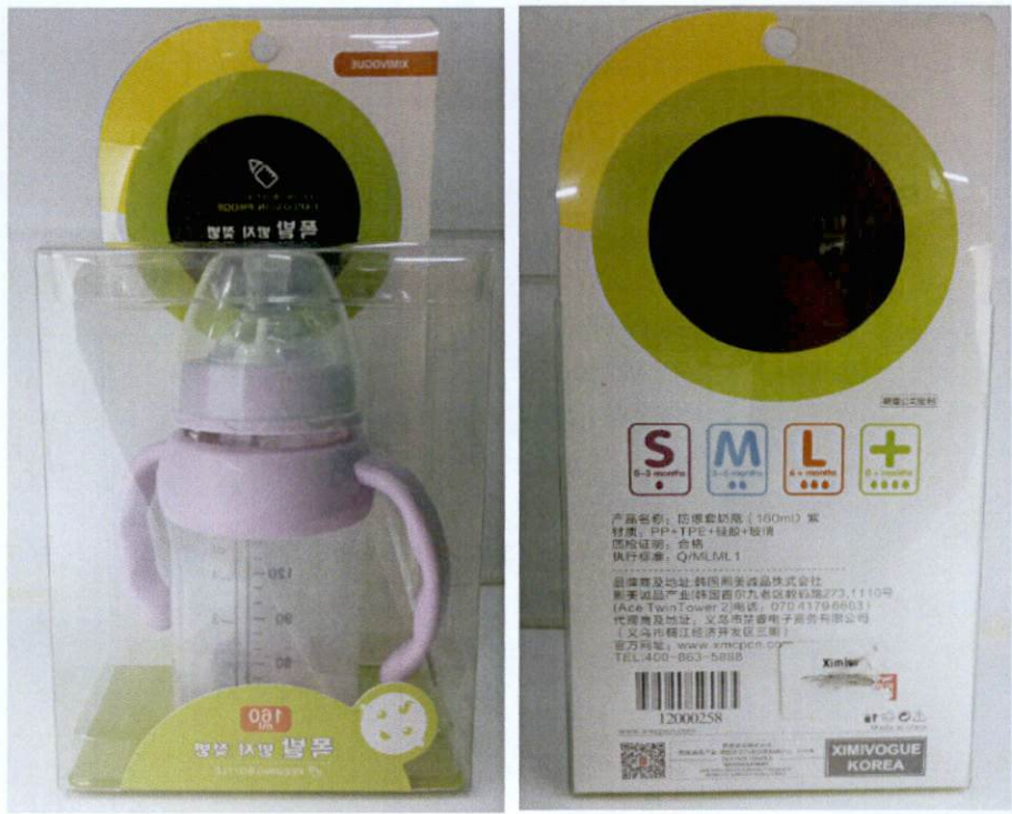
Figure 3. Unnotified Ximivogue Feeding Bottle Explosion-Proof