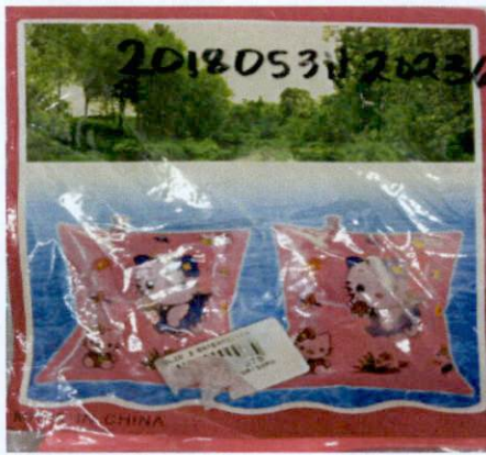
Figure 2. Unnotified Swimming Aid/Armband (Hello Kitty Design)