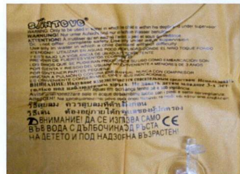
Figure 5. Unnotified Sainteve® Swim Vest