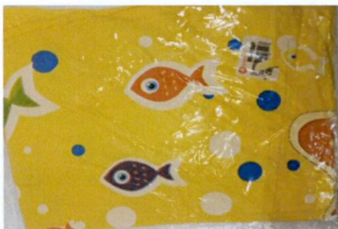
Figure 4. Unnotified Miaofeng Toy Swim Ring