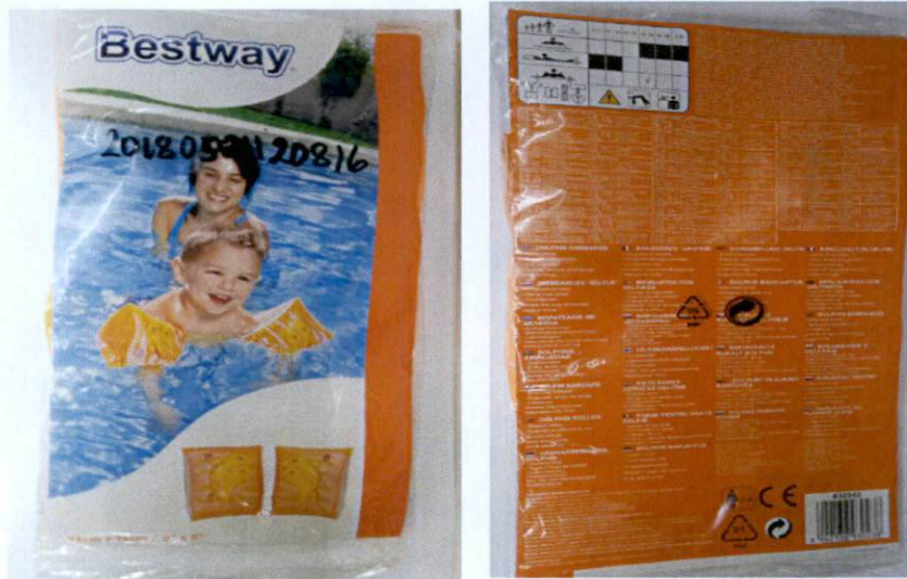
Figure 1. Unnotified Bestway Dolphin Armbands

The Food and Drug Administration (FDA) warns the public from purchasing and using the following Unnotified Toys and Child Care Articles (TCCAs):