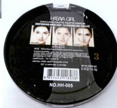
Figure 1. Unnotified Hasaya Girl Contouring Palette Contour (03)