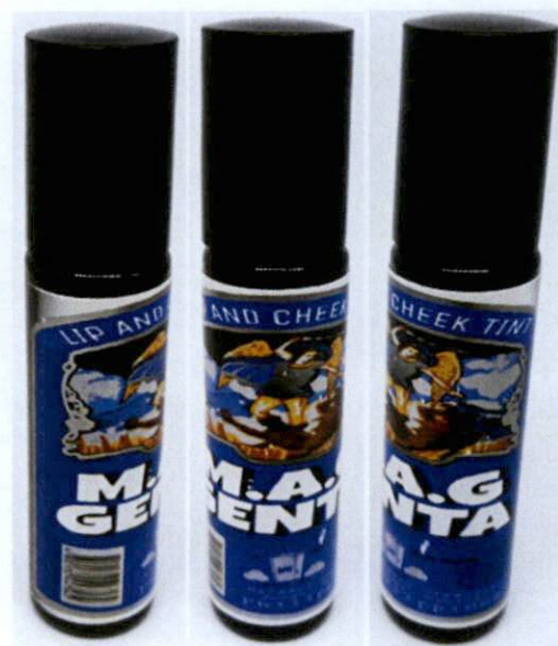
Figure 5. Unnotified M.A.G Genta Lip and Cheek Tint