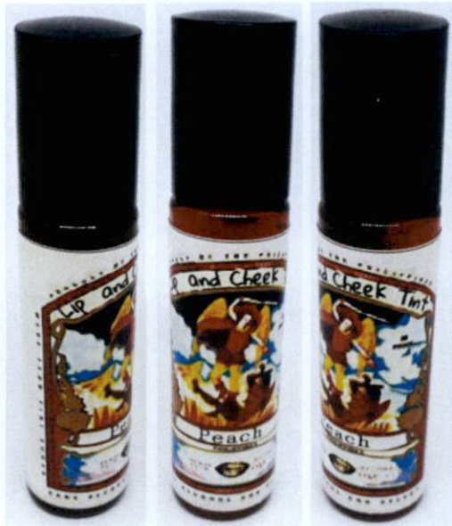
Figure 2. Unnotified Lip and Cheek Tint Peach