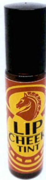
Figure 3. Unnotified Lip Cheek Tint Red