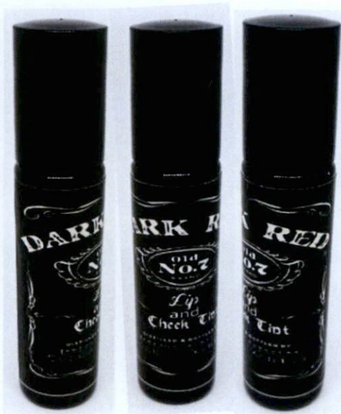
Figure 4. Unnotified Dark Red Old No. 7 Brand Lip and Cheek Tint