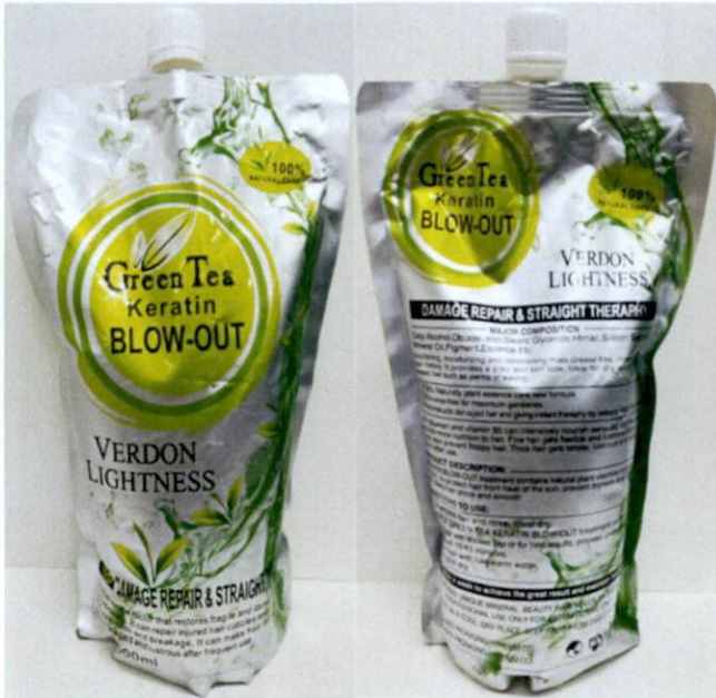
Figure 2. Unnotified Verdon Lightness Green Tea Keratin Blow-Out