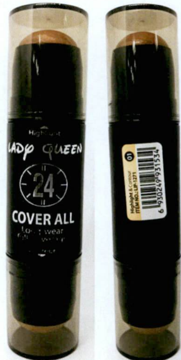
Figure 5. Unnotified Lady Queen 24 Cover All Long-Wear Full Coverage Highlight and Contour (01)