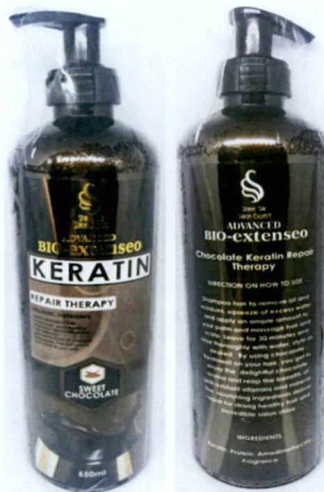
Figure 1. Unnotified Shine Silk Salon Expert Advanced Bio-Extenseo Chocolate Keratin Repair Therapy

The Food and Drug Administration (FDA) warns the public from purchasing and using the following unnotified cosmetic products: