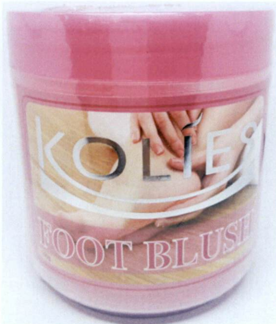
Figure 4. Unnotified Kolies Foot Blush