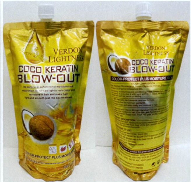
Figure 3. Unnotified Verdon Lightness Coco Keratin Blow-Out