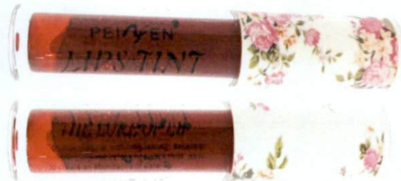
Figure 3. Unnotified Peiyen® Lips Tint The Lure Of Lip (01)