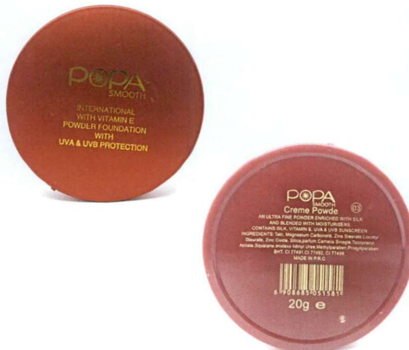
Figure 1. Unnotified Popa Smooth International with Vitamin E Powder Foundation with UVA & UVB Protection

The Food and Drug Administration (FDA) warns the public from purchasing and using the following unnotified cosmetic products: