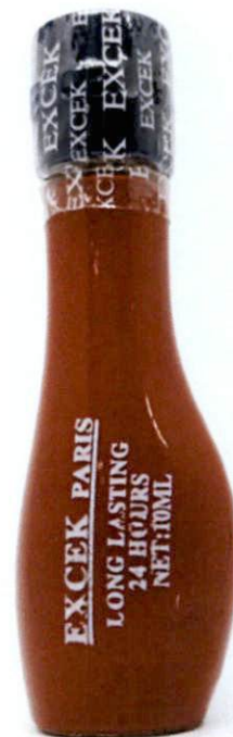
Figure 5. Unnotified Excek Paris Long Lasting 24 Hours