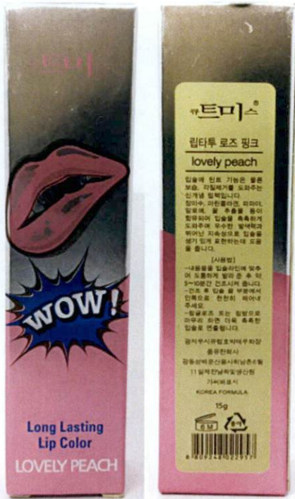
Figure 4. Unnotified Wow Long Lasting Lip Color (Lovely Peach)