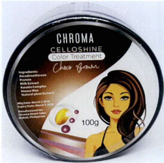
Figure 2. Unnotified Chroma Celloshine Treatment Choco Brown