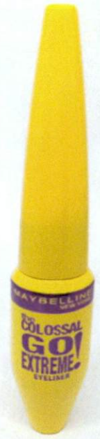
Figure 3. Unnotified Maybelline New York The Colossal Go Extreme Eyeliner