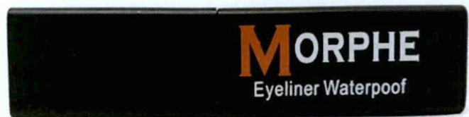
Figure 5. Unnotified Morphe Eyeliner Waterproof