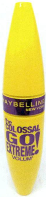
Figure 2. Unnotified Maybelline New York The Colossal Go Extreme Volum Mascara