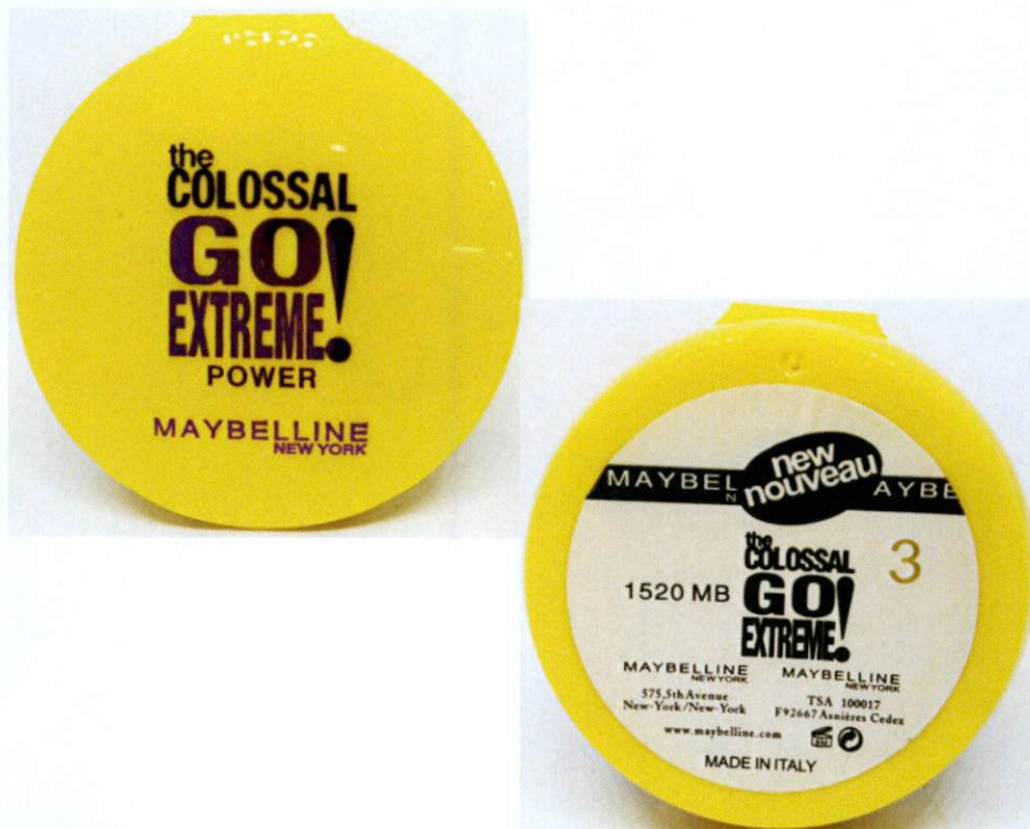
Figure 1. Unnotified Maybelline New York The Colossal Go Extreme Power (03)

The Food and Drug Administration (FDA) warns the public from purchasing and using the following unnotified cosmetic products: