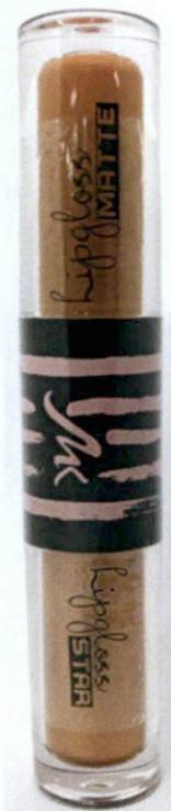
Figure 4. Unnotified Lip Gloss Matte, Lip Gloss Star (03)