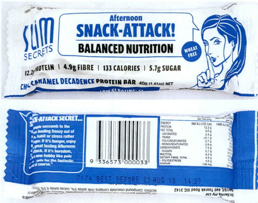
Figure 3. Unregistered SLIM SECRETS AFTERNOON SNACK-ATTACK! BALANCED NUTRITION Choc Caramel Decadence Protein Bar