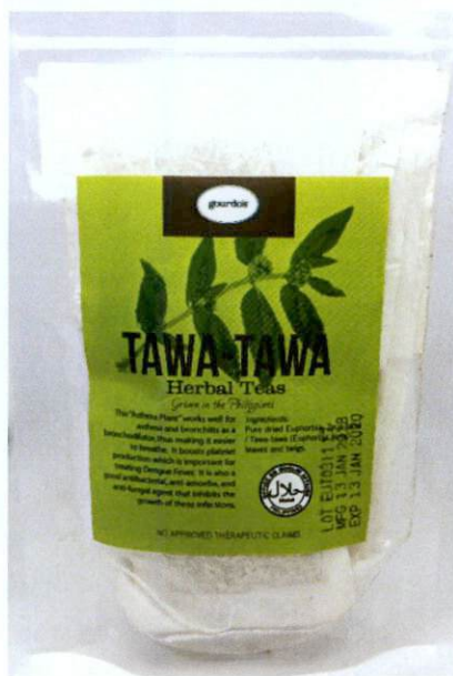
Figure 5. Unregistered GOURDO'S Tawa-tawa Herbal Teas

The FDA verified through post-marketing surveillance that the abovementioned food products are not authorized and the Certificates of Product Registration (CPR) have not been issued. Pursuant to the Republic Act No. 9711, otherwise known as the “Food and Drug Administration Act of 2009”, the manufacture, importation, exportation, sale, offering for sale, distribution, transfer, non-consumer use, promotion, advertising or sponsorship of health products without the proper authorization is prohibited.