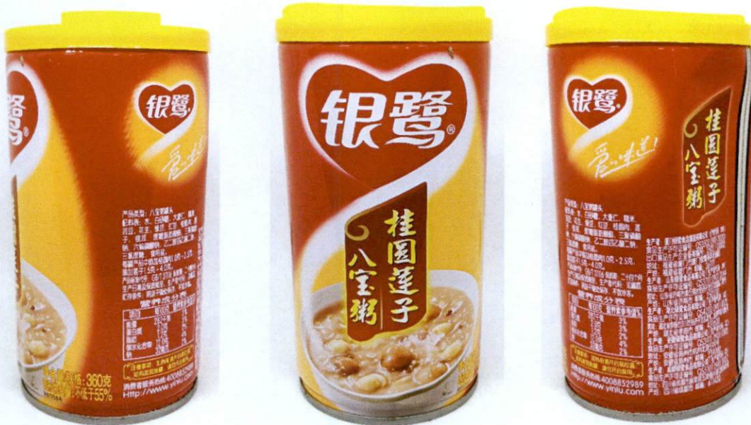
Figure 2. Unregistered YINLU Longan and Lotus Seed Eight-Treasure Porridge