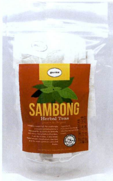
Figure 4. Unregistered GOURDO'S Sambong Herbal Teas