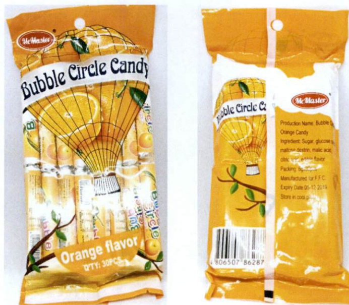
Figure 1. Unregistered MCMASTER Bubble Circle Candy Orange Flavor

The Food and Drug Administration (FDA) warns the public from purchasing and consuming the following unregistered food products: