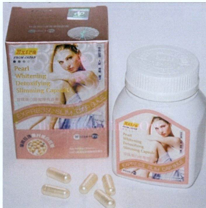
Figure 5. Unregistered EXTRA Pearl Whitening Detoxifying Slimming Capsule Express Slim Capsule