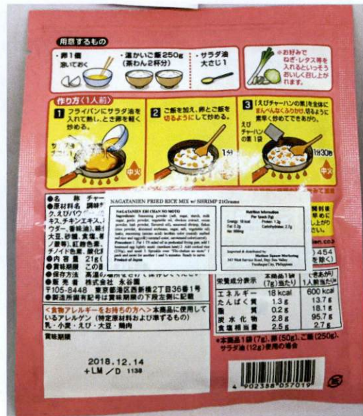
Figure 3. Unregistered NAGATANIEN Fried Rice Mix w/ Shrimp