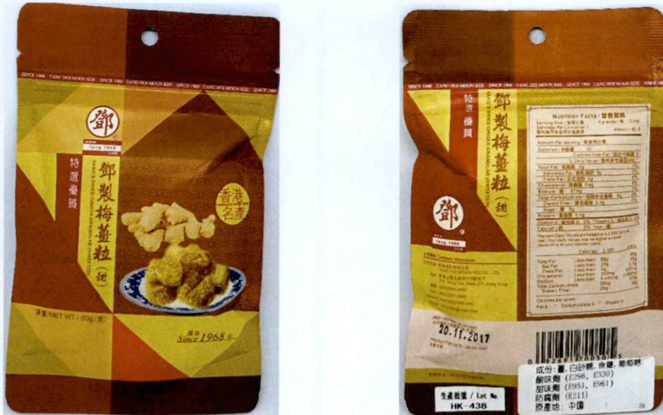
Figure 1. Unregistered TANG'S Dried Ginger Granular (Sweetened)

The Food and Drug Administration (FDA) warns the public from purchasing and consuming the following unregistered food products and food supplements: