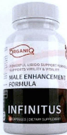
Figure 4. Unregistered ORGANIQ INFINITUS Male Enhancement Formula Dietary Supplement

30 CAPSULES TAKE 1-2 CAPS 30 MINUTES BEFORE DESIRED ACTIVITY