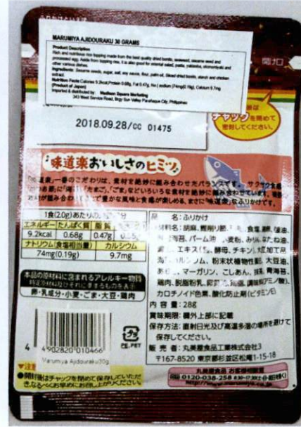
Figure 2. Unregistered MARUMIYA AJIDOURAKU