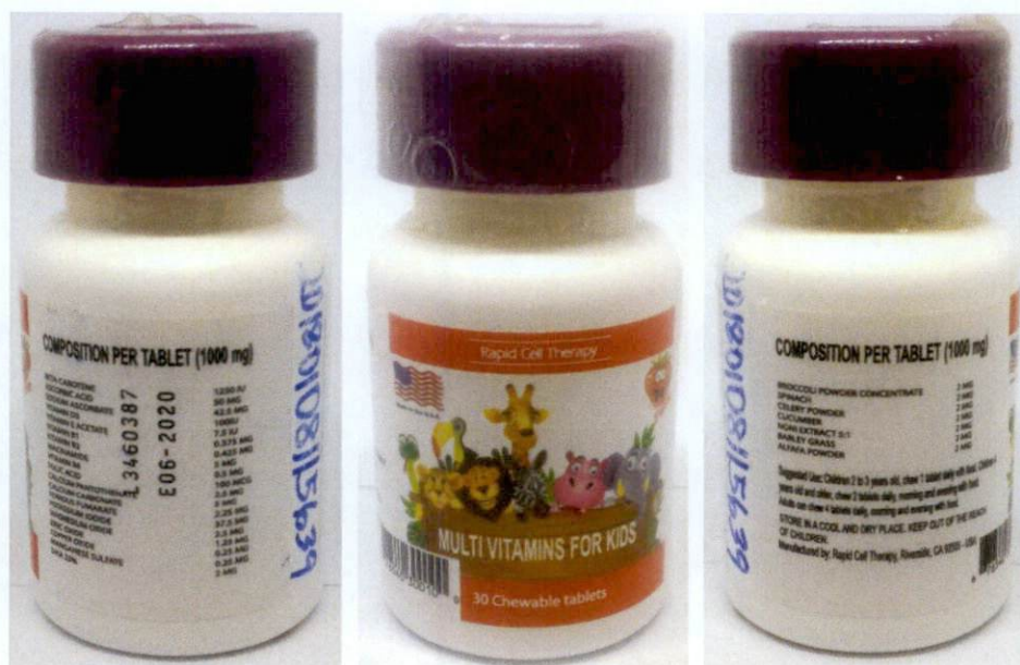
Figure 3. Unregistered RAPIDCELL THERAPY Multi Vitamins for Kids