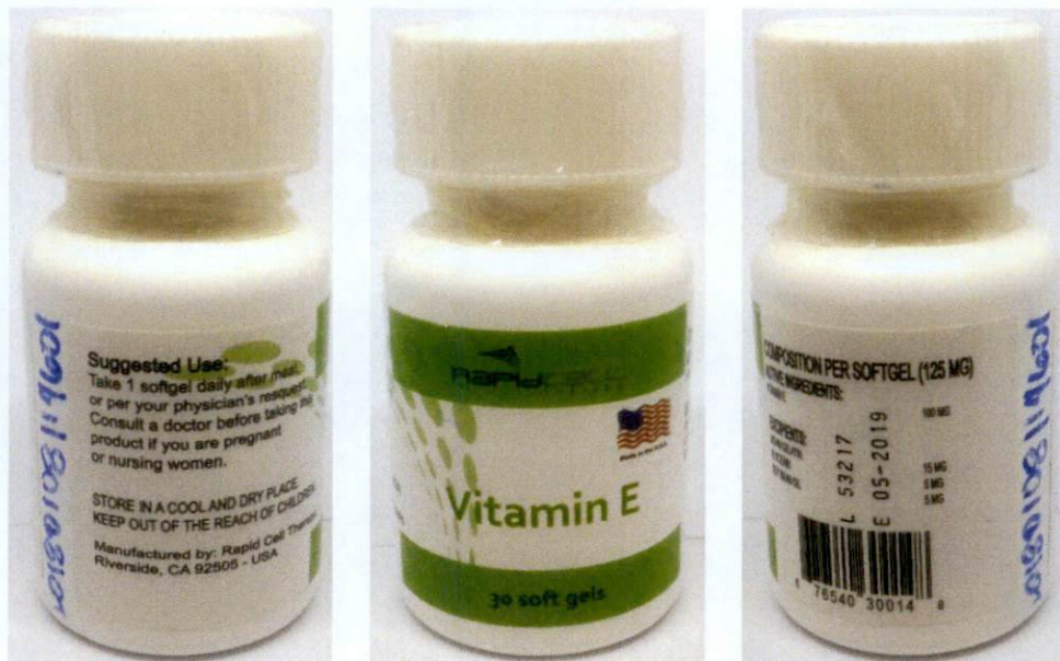
Figure 1. Unregistered RAPIDCELL THERAPY Vitamin E

The Food and Drug Administration (FDA) warns the public from purchasing and consuming the following unregistered food supplements: