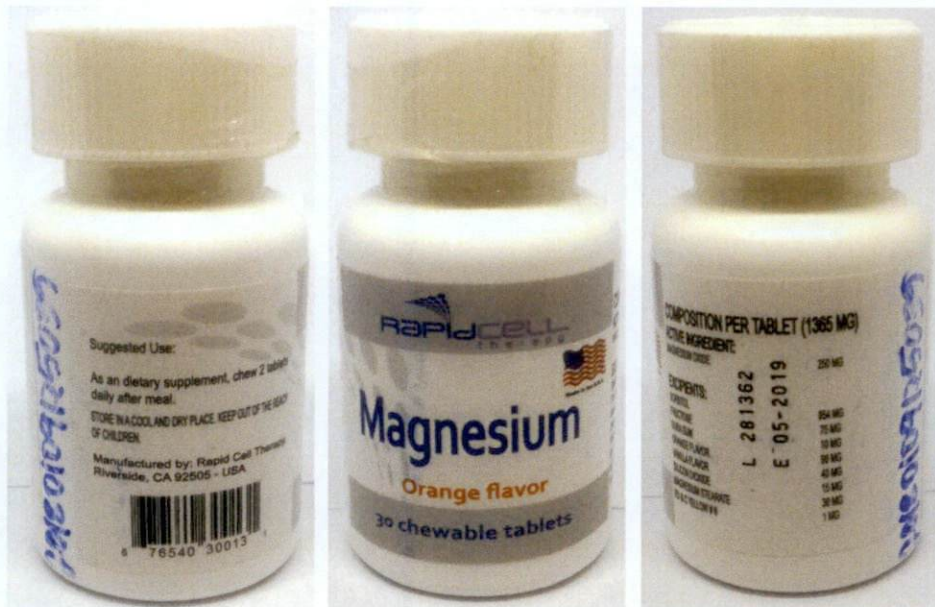
Figure 5. Unregistered RAPIDCELL THERAPY Magnesium Orange Flavor

The FDA verified through post-marketing surveillance that the abovementioned food supplements are not authorized and the Certificates of Product Registration (CPR) have not been issued. Pursuant to the Republic Act No. 9711, otherwise known as the “Food and Drug Administration Act of 2009”, the manufacture, importation, exportation, sale, offering for sale, distribution, transfer, non-consumer use, promotion, advertising or sponsorship of health products without the proper authorization is prohibited.