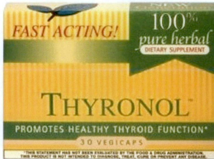
Figure 4. Unregistered THYRONOL Dietary Supplement