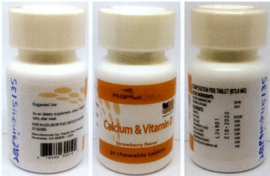
Figure 2. Unregistered RAPIDCELL THERAPY Calcium & Vitamin D Strawberry Flavor