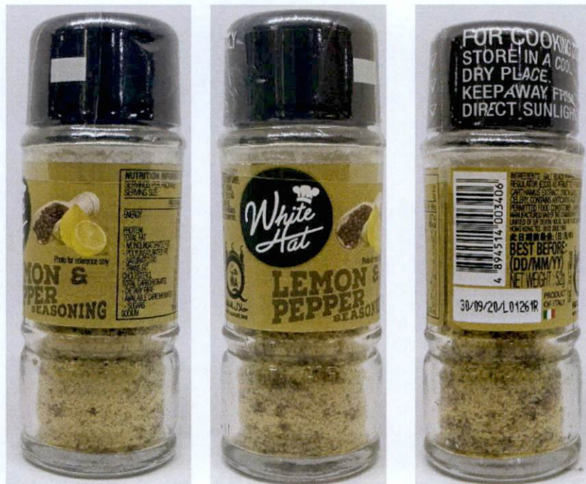
Figure 3. Unregistered WHITE HAT Lemon & Pepper Seasoning