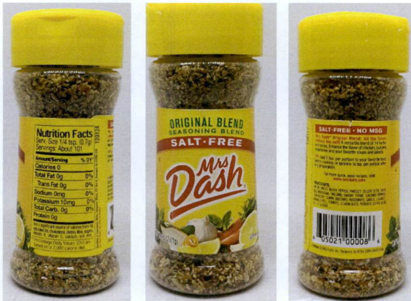
Figure 4. Unregistered MRS. DASH ORIGINAL BLEND Seasoning Blend Salt Free