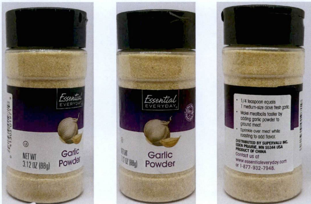
Figure 1. Unregistered ESSENTIAL EVERYDAY Garlic Powder

The Food and Drug Administration (FDA) warns the public from purchasing and consuming the following unregistered food products and food supplement: