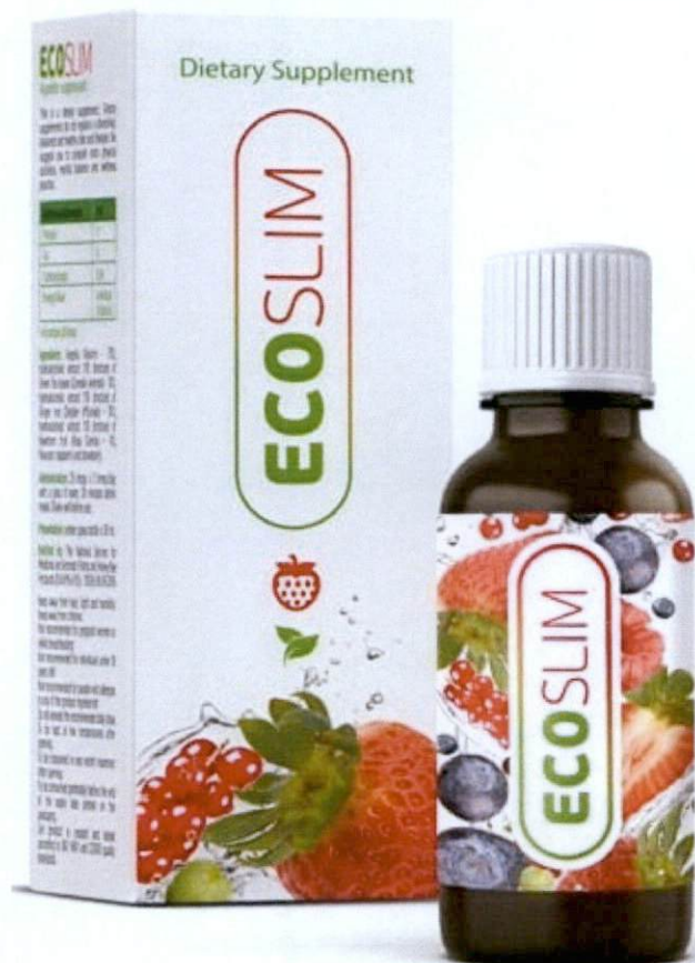
Figure 5. Unregistered ECOSLIM Dietary Supplement