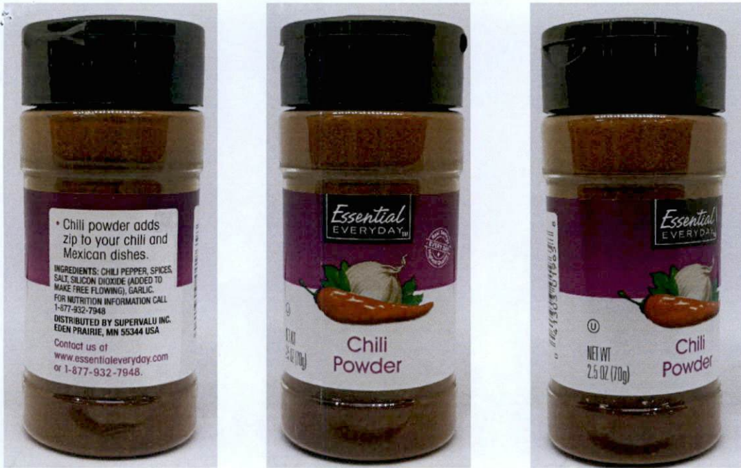
Figure 2. Unregistered ESSENTIAL EVERYDAY Chili Powder