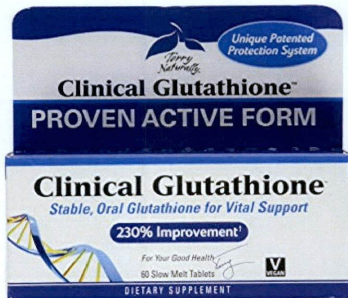
Figure 3. Unregistered CLINICAL GLUTATHIONE Stable, Oral Glutathione for Vital Support Dietary Supplement Slow Melt Tablets