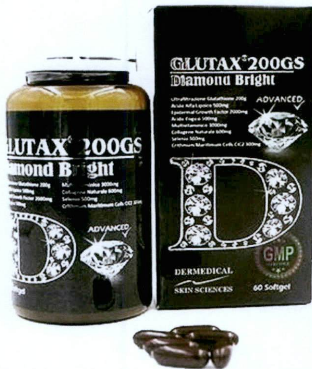
Figure 5. Unregistered GLUTAX 200GS Diamond Bright Glutathione Softgel

The FDA verified through post-marketing surveillance that the abovementioned food supplements are not authorized and the Certificates of Product Registration (CPR) have not been issued. Pursuant to the Republic Act No. 9711, otherwise known as the “Food and