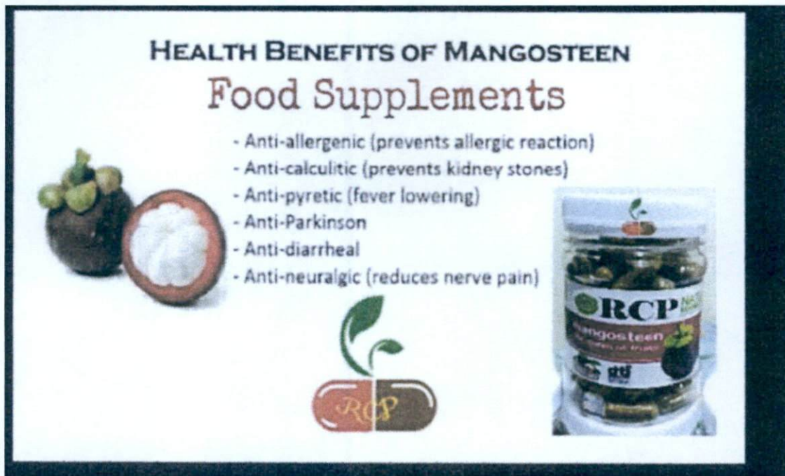
Figure 2. Unregistered RCP Mangosteen Food Supplement