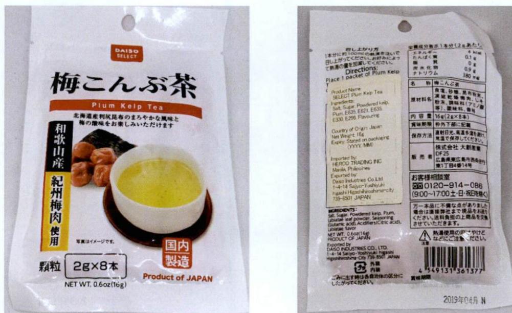
Figure 4. Unregistered DAISO SELECT Plum Kelp Tea

The FDA verified through post-marketing surveillance that the abovementioned food products are not registered, hence authorization in the form of Certificate of Product Registration (CPR) has not yet been issued. Pursuant to Republic Act No. 9711, otherwise known as the “Food and Drug Administration Act of 2009”, the manufacture, importation, exportation, sale, offering for sale, distribution, transfer, non-consumer use, promotion, advertising or sponsorship of health products without the proper authorization from FDA is prohibited.