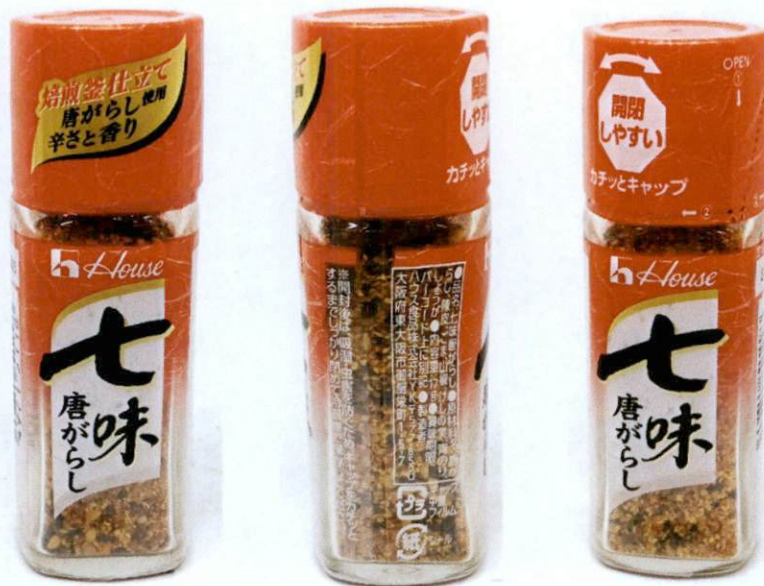
Figure 3. Unregistered HOUSE Ground Chilli Pepper (in foreign characters)