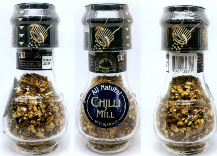
Figure 1. Unregistered DROGHERIA ALIMENTARI Chilli Mill

The Food and Drug Administration (FDA) warns the public from purchasing and consuming the following unregistered food products: