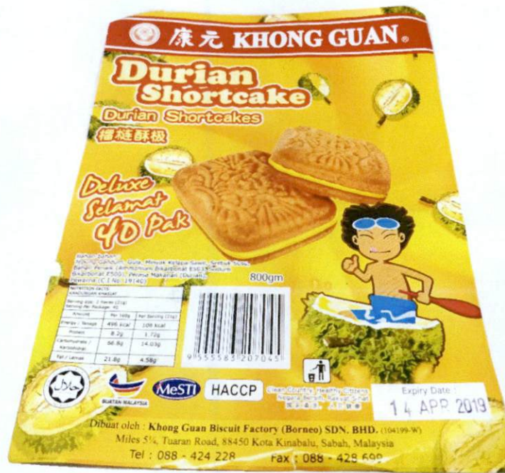
Figure 2. Unregistered KHONG GUAN Durian Shortcake