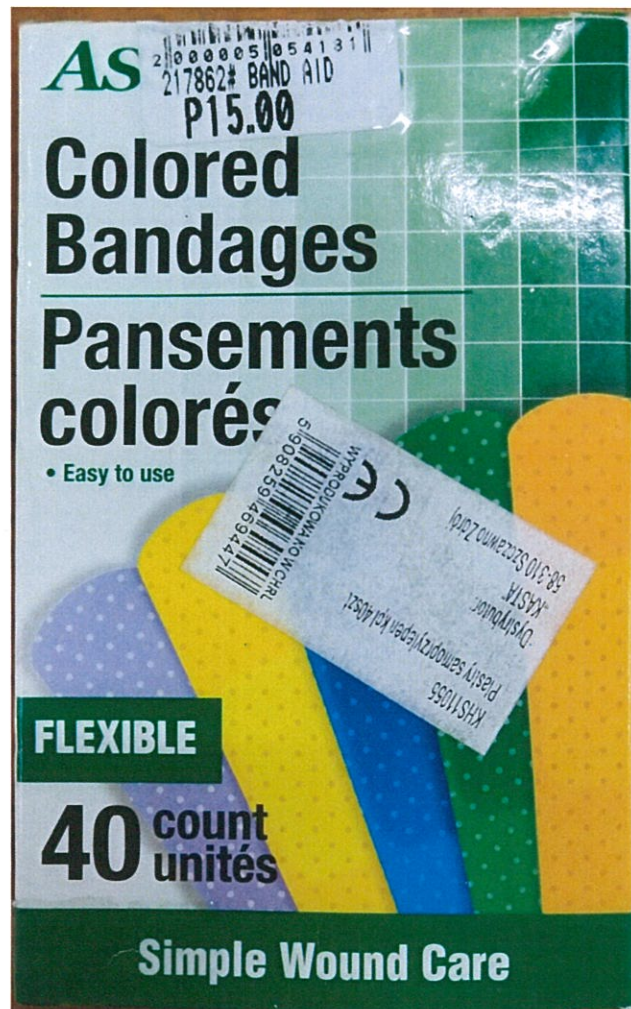
Figure 1. Unregistered Assured® Colored Bandages

The Food and Drug Administration (FDA) warns all healthcare professionals and the general public against the purchase and use of the unregistered medical device: