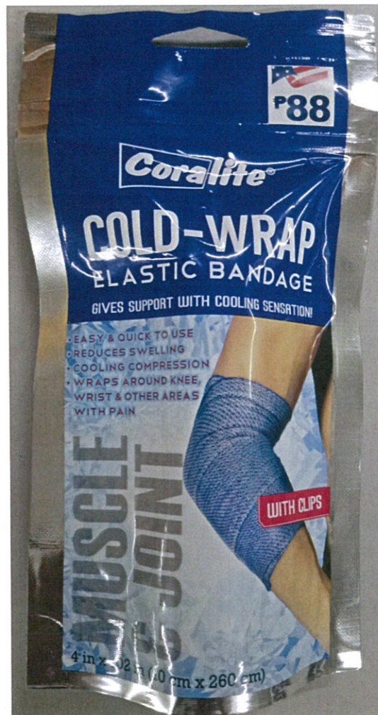
Figure 1. Unregistered Coralite® Cold-Wrap Elastic Bandage

The Food and Drug Administration (FDA) warns all healthcare professionals and the general public against the purchase and use of the unregistered medical device: