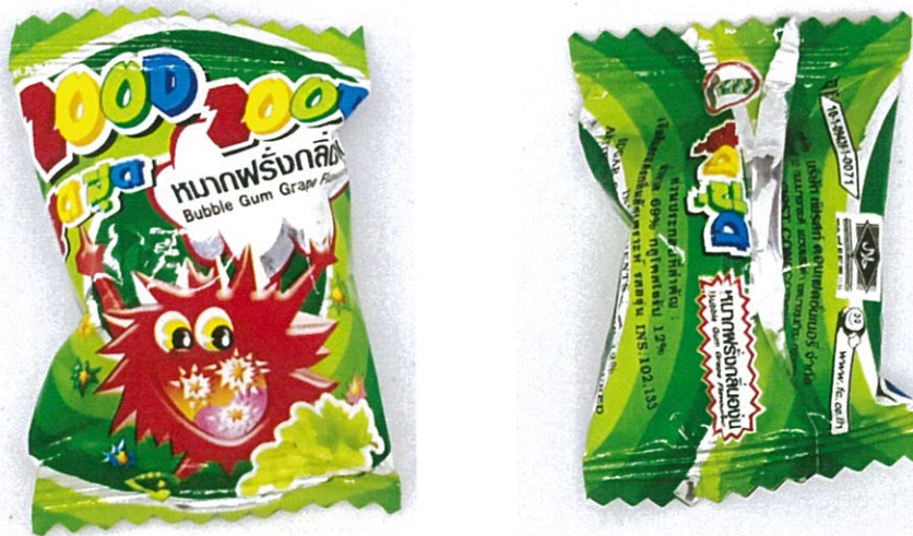
Figure 1. Unregistered ZOOD ZOOD Bubble Gum Grape Flavoured

The Food and Drug Administration (FDA) warns the public from purchasing and consuming the following unregistered food products: