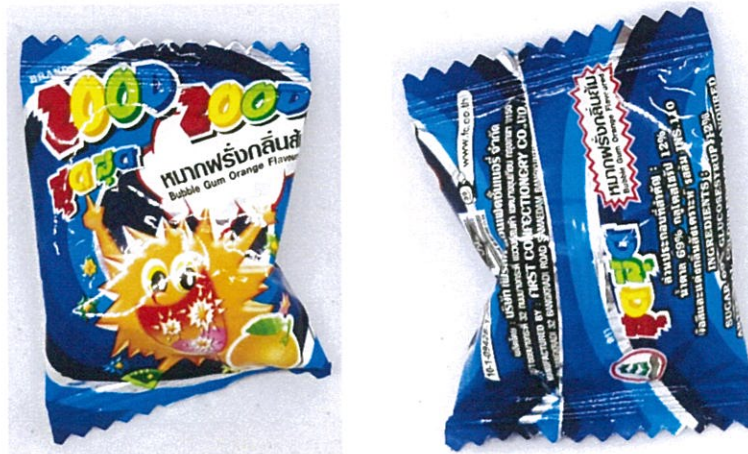
Figure 2. Unregistered ZOOD ZOOD Bubble Gum Orange Flavoured