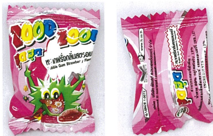
Figure 4. Unregistered ZOOD ZOOD Bubble Gum Strawberry Flavoured