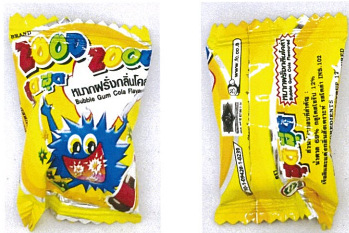
Figure 3. Unregistered ZOOD ZOOD Bubble Gum Cola Flavoured