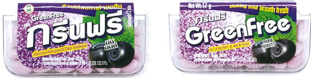
Figure 2. Unregistered GREENFREE Blueberry & Menthol Flavoured Candy