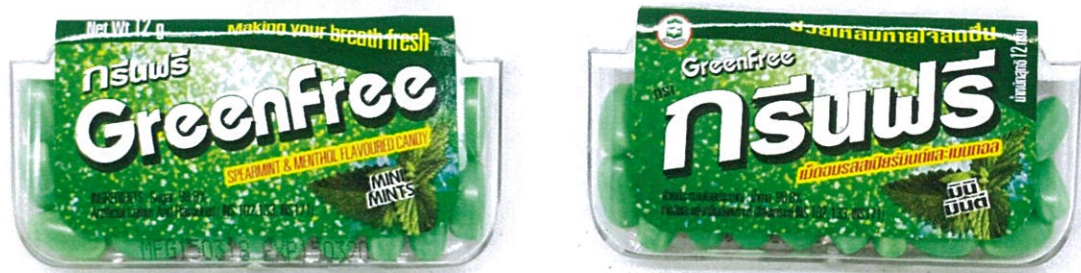
Figure 3. Unregistered GREENFREE Spearmint & Menthol Flavoured Candy