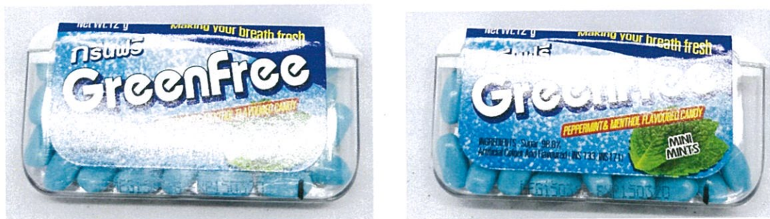
Figure 4. Unregistered GREENFREE Peppermint & Menthol Flavoured Candy

The FDA verified through post-marketing surveillance that the abovementioned food products are not authorized and the Certificates of Product Registration (CPR) have not been issued. Pursuant to the Republic Act No. 9711, otherwise known as the “Food and Drug Administration Act of 2009”, the manufacture, importation, exportation, sale, offering for sale, distribution, transfer, non-consumer use, promotion, advertising or sponsorship of health products without the proper authorization is prohibited.