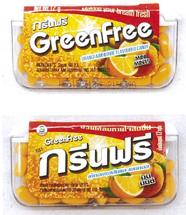
Figure 1. Unregistered GREENFREE Orange & Menthol Flavoured Candy

The Food and Drug Administration (FDA) warns the public from purchasing and consuming the following unregistered food products: