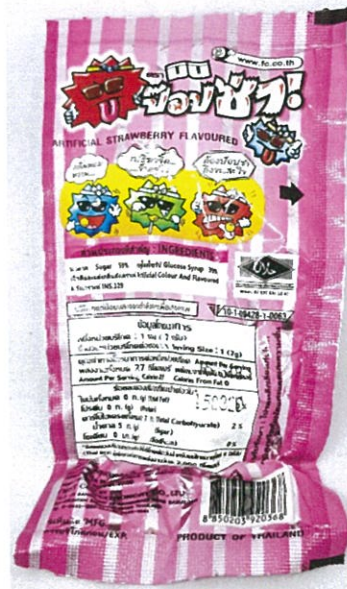
Figure 3. Unregistered MINI POPZA Lollipop Artificial Strawberry Flavoured