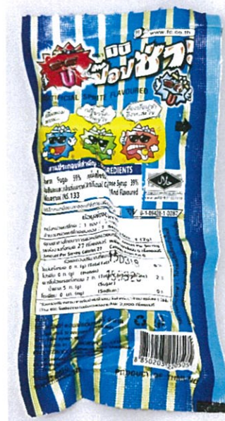
Figure 2. Unregistered MINI POPZA Lollipop Artificial Sprite Flavoured