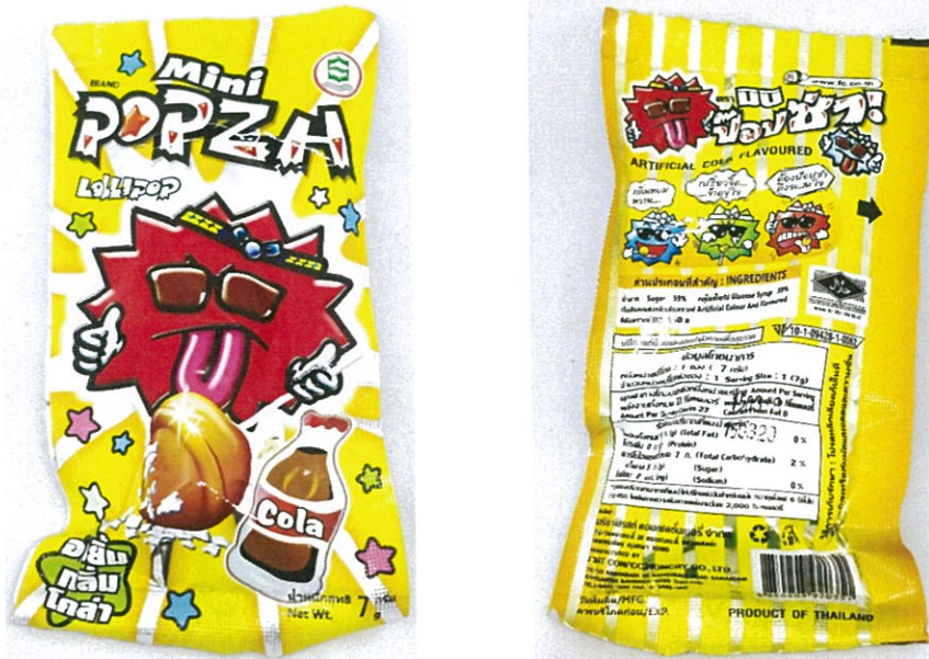
Figure 1. Unregistered MINI POPZA Lollipop Artificial Cola Flavoured

The Food and Drug Administration (FDA) warns the public from purchasing and consuming the following unregistered food products: