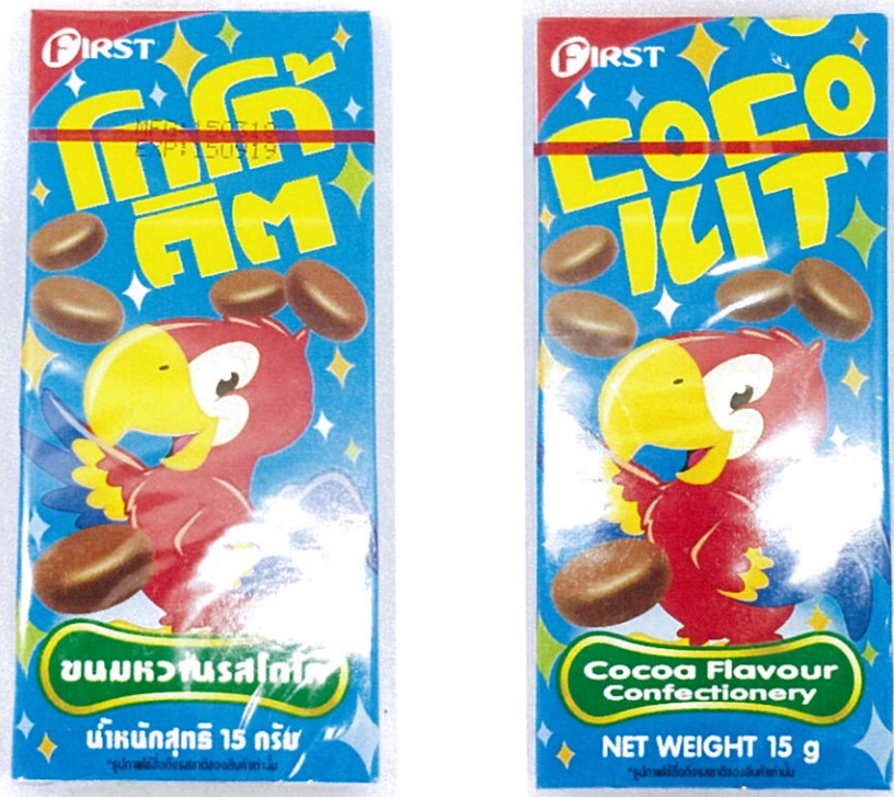
Figure 4. Unregistered FIRST COCO KIT Cocoa Flavour Confectionery

The FDA verified through post-marketing surveillance that the abovementioned food products are not authorized and the Certificates of Product Registration (CPR) have not been issued. Pursuant to the Republic Act No. 9711, otherwise known as the “Food and Drug Administration Act of 2009”, the manufacture, importation, exportation, sale, offering for sale, distribution, transfer, non-consumer use, promotion, advertising or sponsorship of health products without the proper authorization is prohibited.