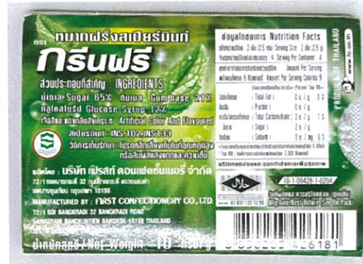
Figure 3. Unregistered GREENFREE Spearmint Chewing Gum