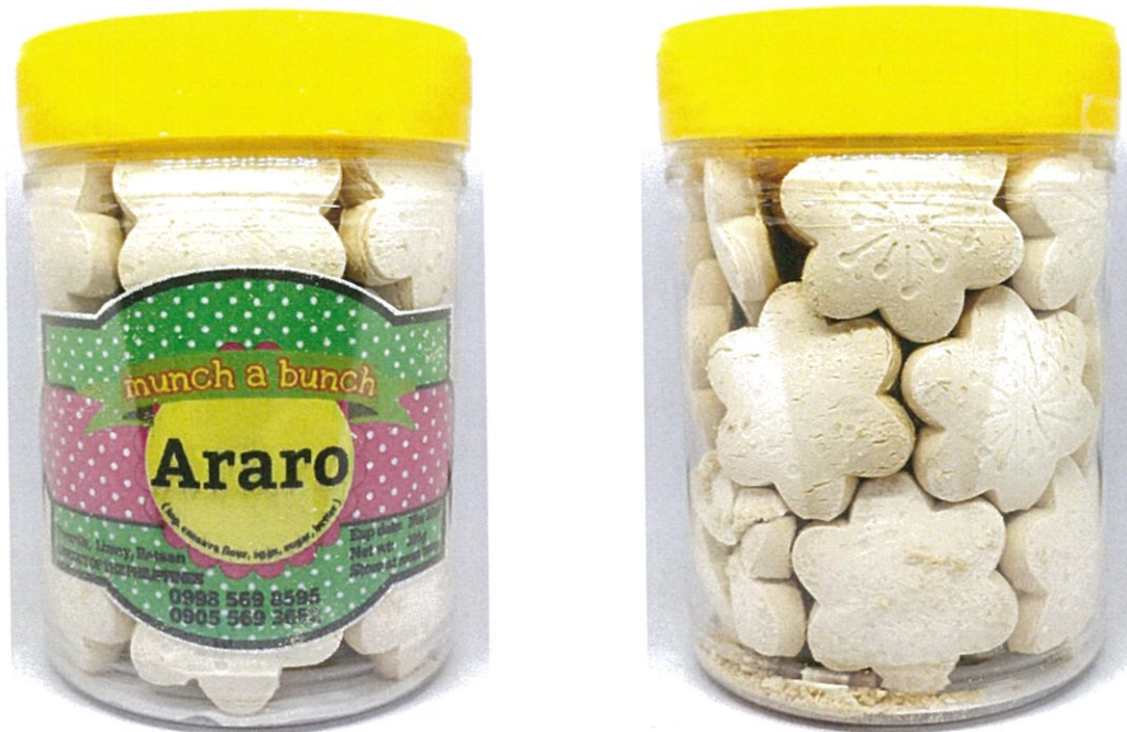
Figure 1. Unregistered MUNCH A BUNCH Araro

The Food and Drug Administration (FDA) warns the public from purchasing and consuming the following unregistered food products: