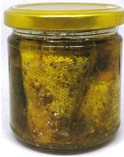
Figure 2. Unregistered ARA'S MAMI HOUSE & RESTAURANT Gourmet Bangus Fresh Basil Pesto in Olive Oil