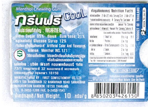
Figure 4. Unregistered GREENFREE Menthol Chewing Gum