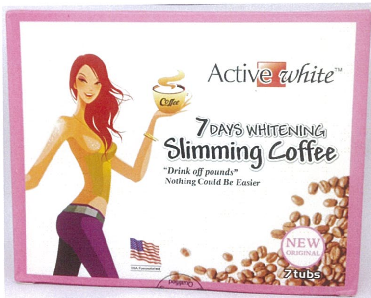
Figure 3. Unregistered ACTIVE WHITE 7 Days Whitening Slimming Coffee