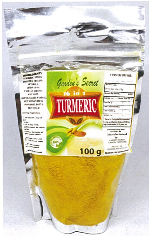
Figure 2. Unregistered GARDEN'S SECRET 16 in 1 Turmeric Powder