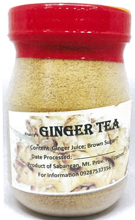
Figure 1. Unregistered FRUCCY'S Ginger Tea

The Food and Drug Administration (FDA) warns the public from purchasing and consuming the following unregistered food products and food supplement: