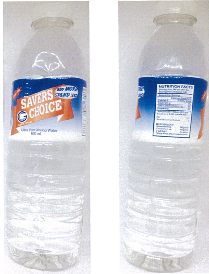
Figure 2. Unregistered SAVER'S CHOICE Ultra Pure Drinking Water