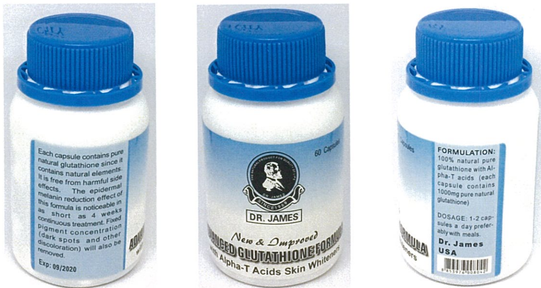
Figure 3. Unregistered DR. JAMES Advanced Glutathione Formula with Alpha-T Acids Skin Whiteners