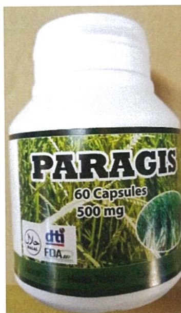
Figure 1. Unregistered PARAGIS Capsules

The Food and Drug Administration (FDA) warns the public from purchasing and consuming the following unregistered food products and food supplements: