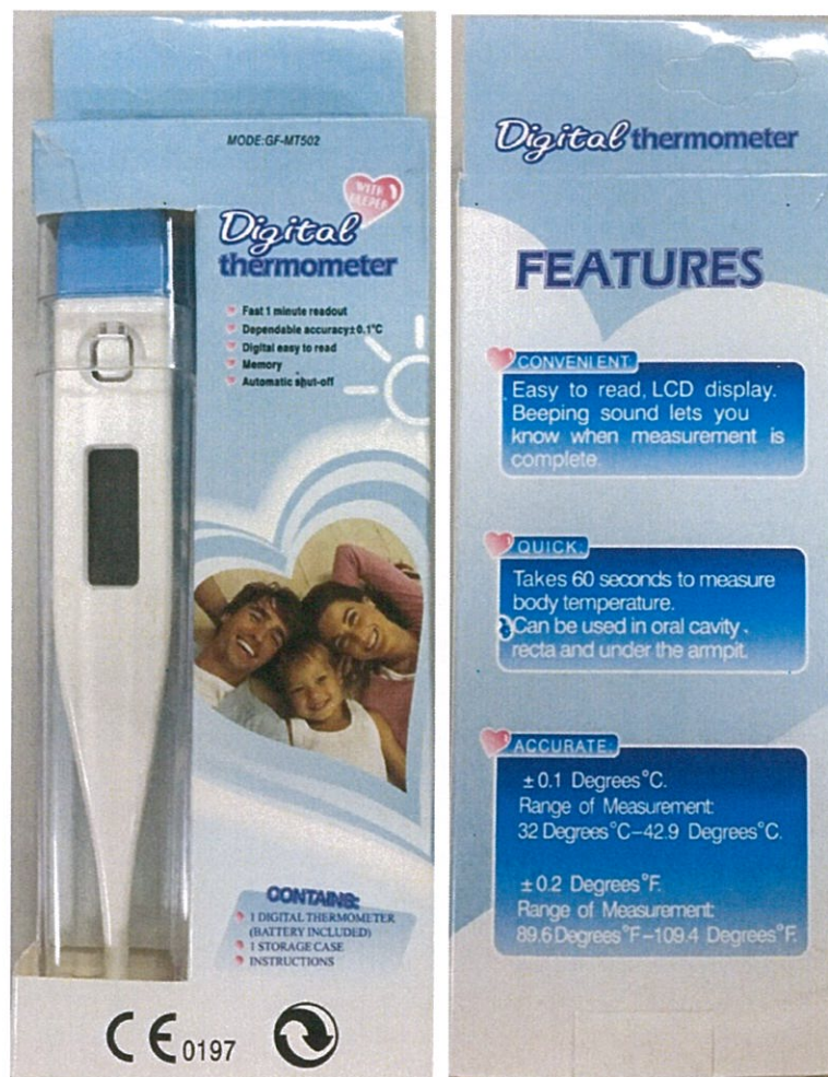
Figure 1. Unregistered Digital Thermometer

The Food and Drug Administration (FDA) warns the general public and all healthcare professionals against the purchase and use of the unregistered medical devices: