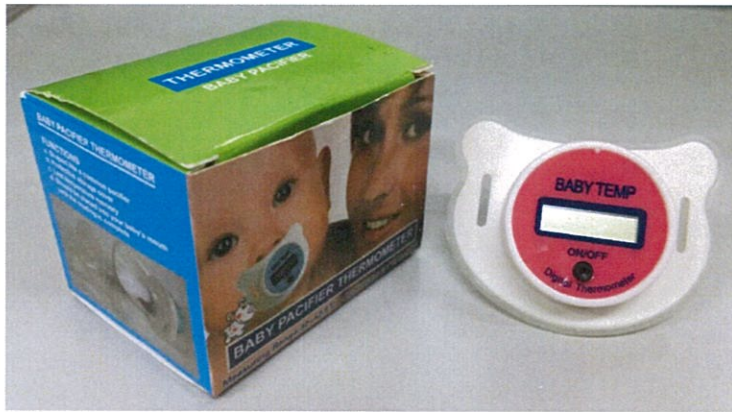
Figure 2. Unregistered Baby Pacifier Thermometer

The FDA verified through post-marketing surveillance that the abovementioned medical devices are not registered and the Certificates of Product Registration (CPR) have not yet been issued. Pursuant to the Republic Act No. 9711, otherwise known as the “Food and Drug Administration Act of 2009”, the manufacture, importation, exportation, sale, offering for sale, distribution, transfer, non-consumer use, promotion, advertising or sponsorship of health products without the proper authorization is prohibited.