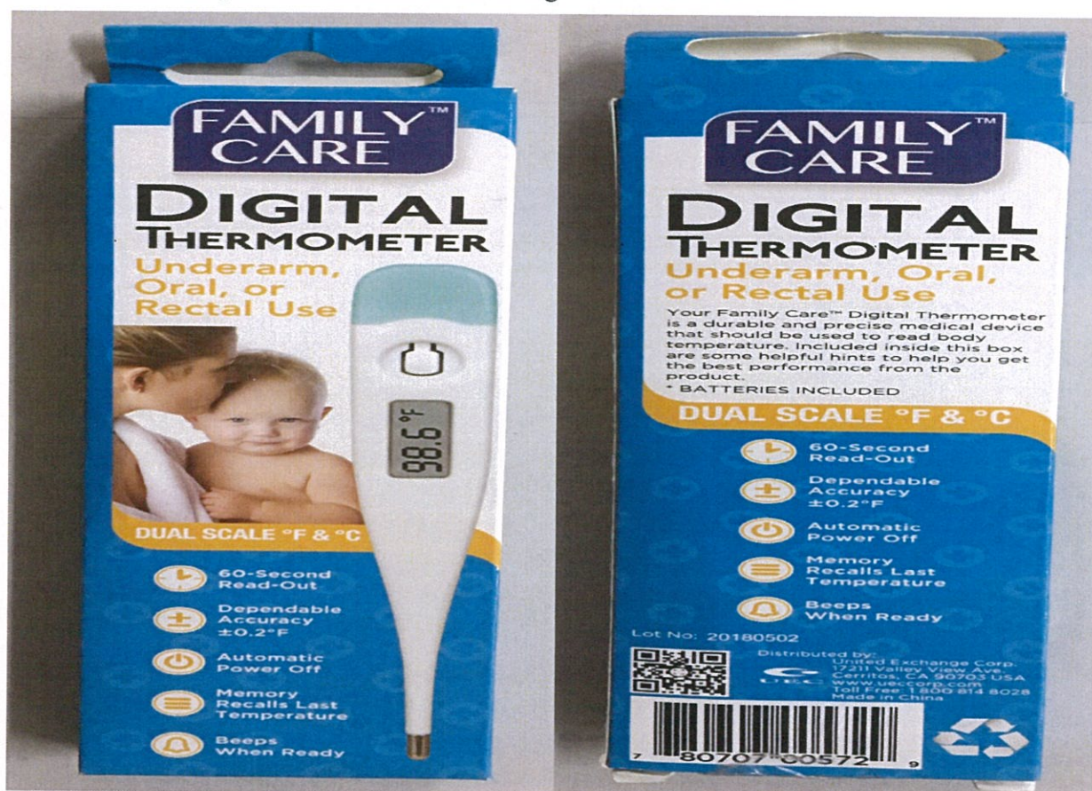
Figure 1. Unregistered Family Care™ Digital Thermometer

The Food and Drug Administration (FDA) warns all healthcare professionals and the general public against the purchase and use of the unregistered medical device: