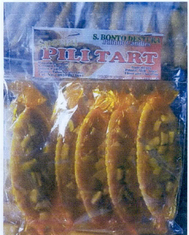
Figure 5. Unregistered S.BONTO.DESTURA Pilinut Candies, Special Pili Tart