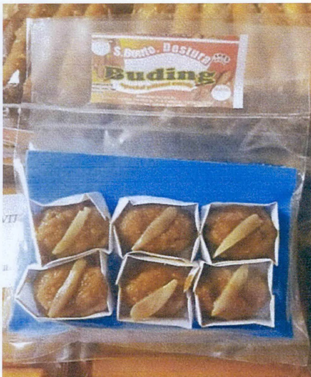
Figure 4. Unregistered S.BONTO. DESTURA Buding Special Pilinut Candy