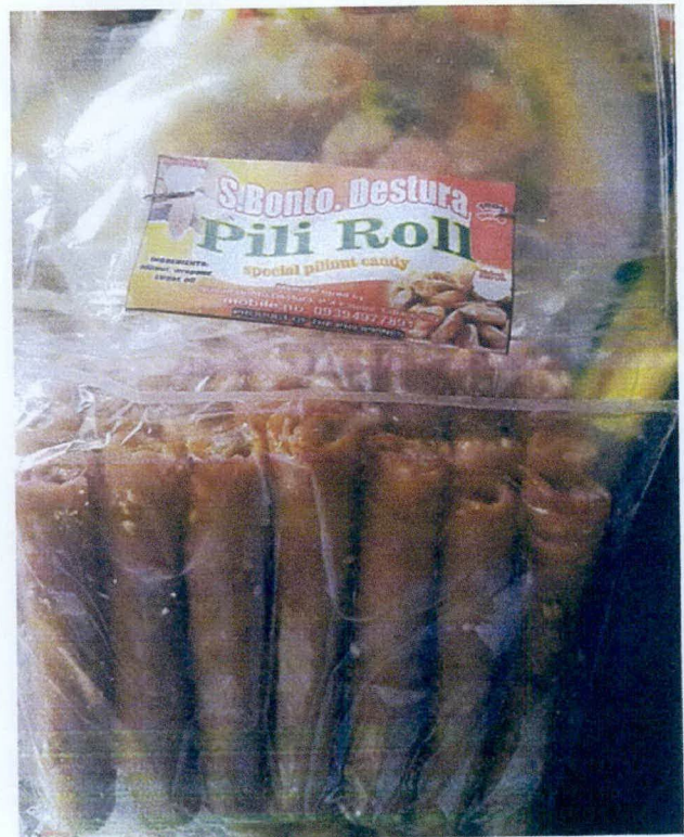
Figure 3. Unregistered S.BONTO. DESTURA Pili Roll Special Pilinut Candy