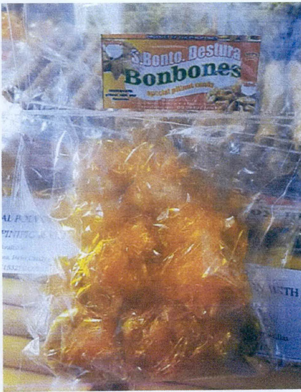
Figure 2. Unregistered S.BONTO.DESTURA Bonbones Special Pilinut Candy