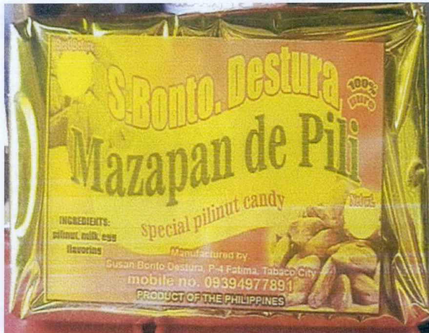
Figure 1. Unregistered S. BONTO. DESTURA Mazapan de Pili Special Pilinut Candy

The Food and Drug Administration (FDA) warns the public from purchasing and consumption of the following unregistered food products: