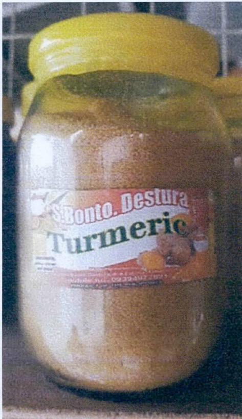
Figure 4. Unregistered S.BONTO. DESTURA Turmeric