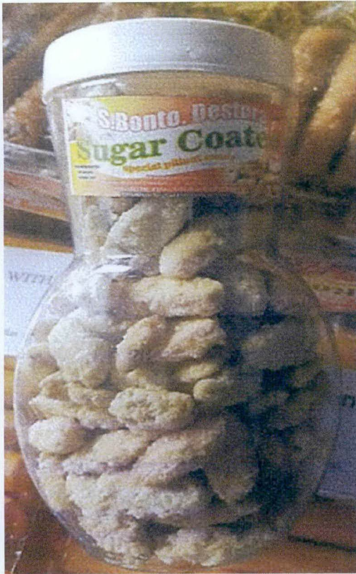
Figure 2. Unregistered S.BONTO.DESTURA Sugar Coated Special Pili nut Candy