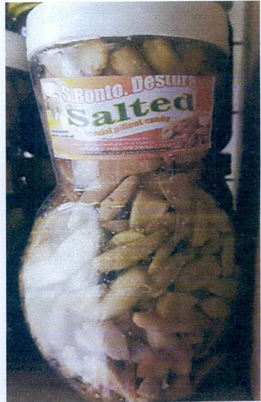
Figure 3. Unregistered S.BONTO. DESTURA Salted Special Pili nut Candy