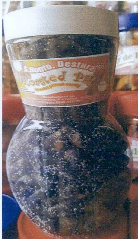
Figure 1. Unregistered S. BONTO. DESTURA Roasted Special Pilinut Candy

The Food and Drug Administration (FDA) warns the public from purchasing and consumption of the following unregistered food products: