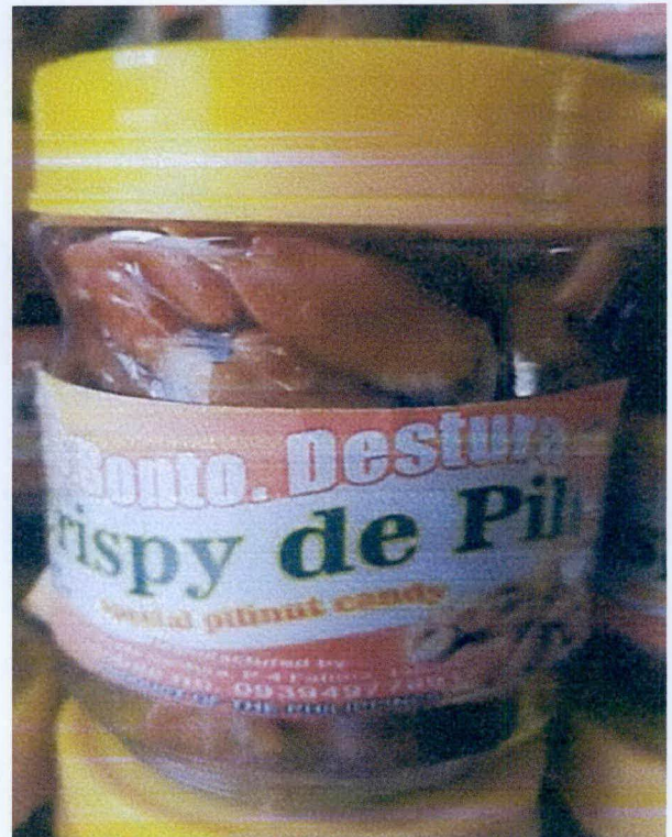
Figure 5. Unregistered S.BONTO.DESTURA Crispy de Pili, Special Pili nut Candy