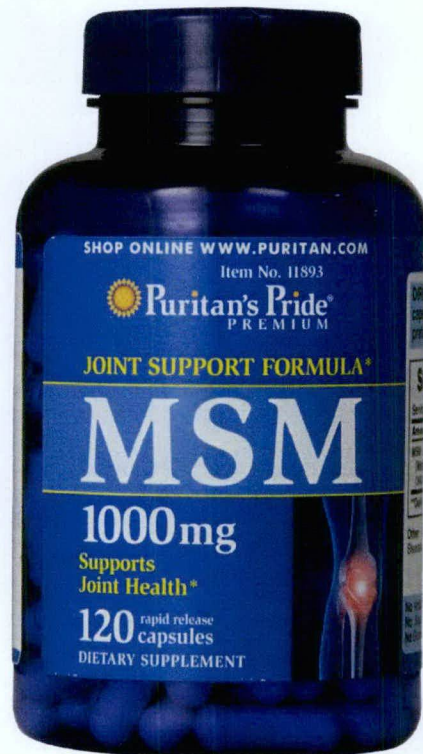
Figure 5. Unregistered PURITAN'S PRIDE Premium Joint Support Formula MSM, 1000mg