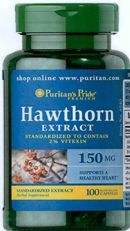
Figure 2. Unregistered PURITAN'S PRIDE Premium Hawthorn Extract, 150mg