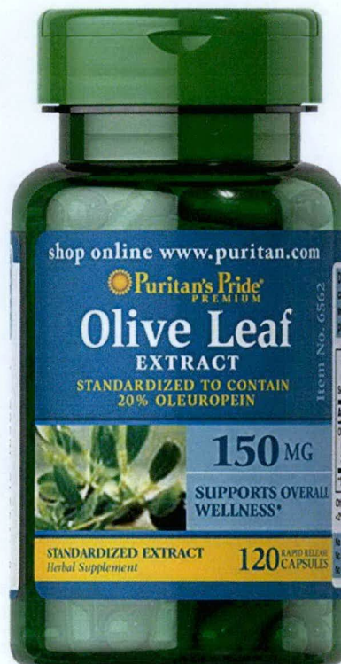
Figure 1. Unregistered PURITAN'S PRIDE Premium Olive Leaf Extract, 150mg

The Food and Drug Administration (FDA) warns the public from purchasing and consuming the following unregistered food supplements: