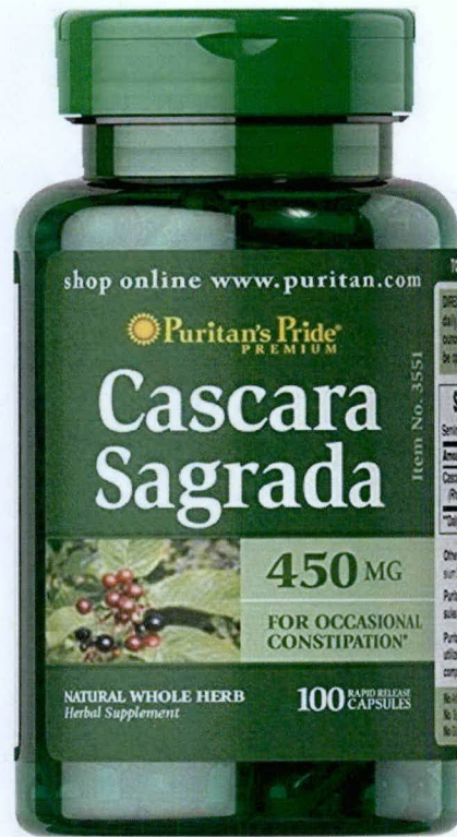
Figure 3. Unregistered PURITAN'S PRIDE Premium Cascara Sagrada, 450mg