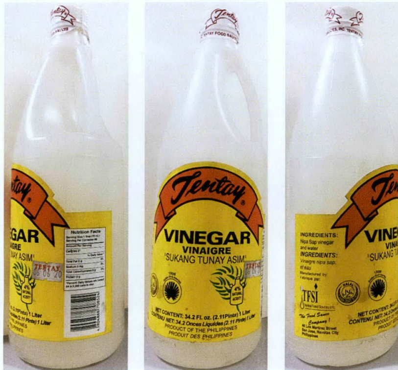
Figure 1. Unregistered TENTAY Vinegar Sukang Tunay Asim

The Food and Drug Administration (FDA) warns the public from purchasing and consuming the following unregistered food products: