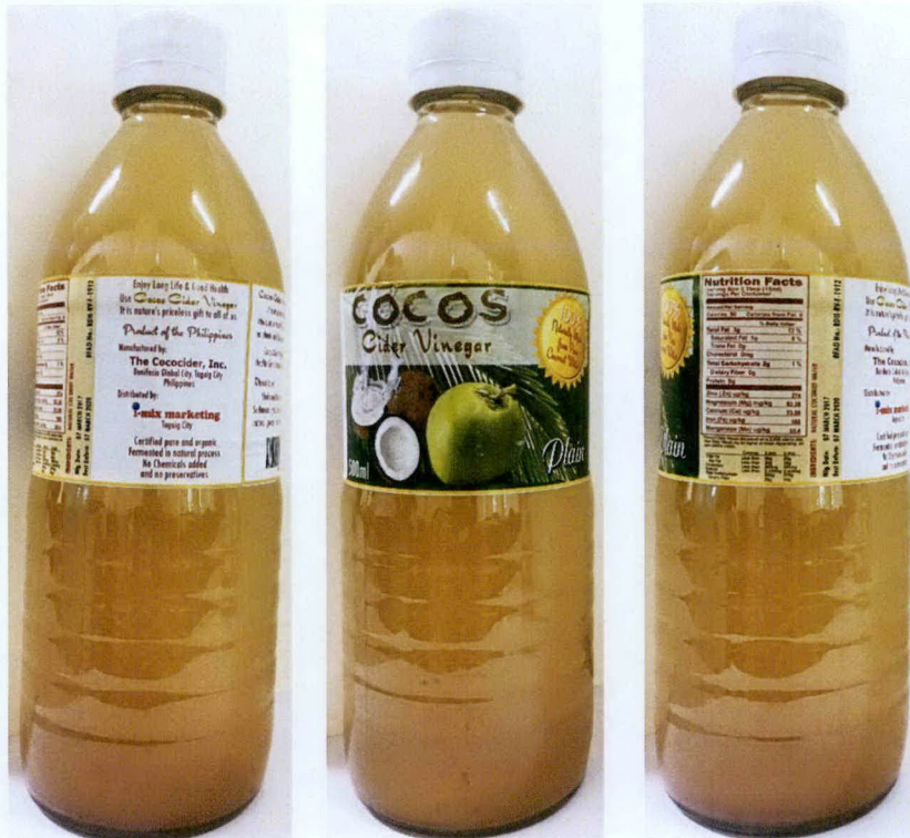
Figure 2. Unregistered COCOS Cider Vinegar Plain