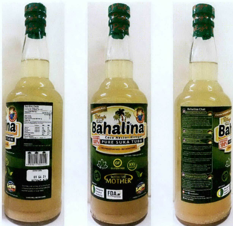
Figure 3. Unregistered RIKOY'S Bahalina Coco Nectar Vinegar Pure Suka Tuba Classic Sukang Puti