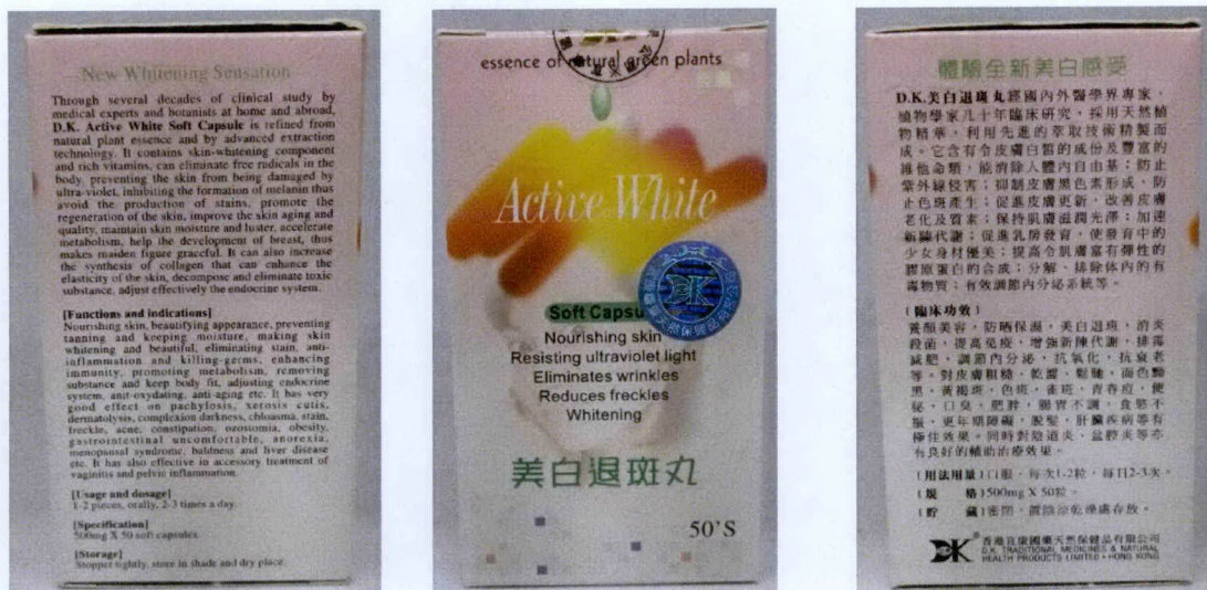
Figure 4. Unregistered D.K. Active White Soft Capsule

The FDA verified through post-marketing surveillance that the abovementioned food supplements are not authorized and the Certificates of Product Registration (CPR) have not been issued. Pursuant to the Republic Act No. 9711, otherwise known as the “Food and Drug Administration Act of 2009”, the manufacture, importation, exportation, sale, offering for sale, distribution, transfer, non-consumer use, promotion, advertising or sponsorship of health products without the proper authorization is prohibited.