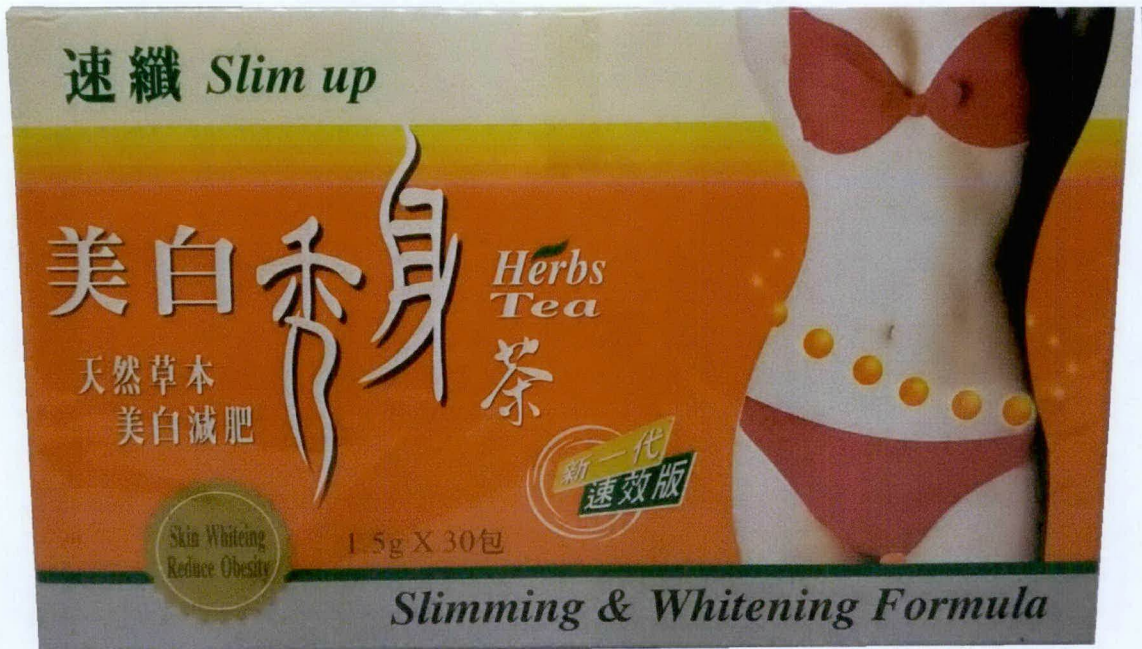
Figure 2. Unregistered SLIM UP Slimming & Whitening Formnula Herbs Tea