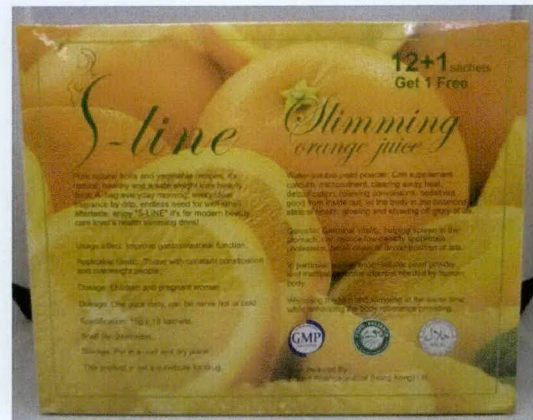
Figure 3. Unregistered S-LINE Slimming Orange Juice