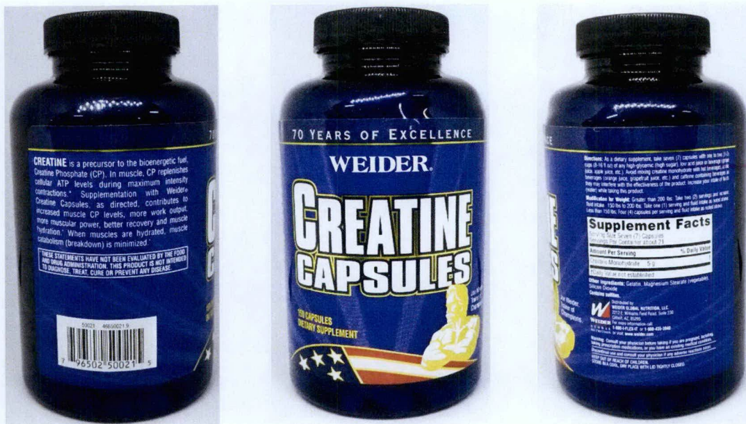
Figure 4. Unregistered WEIDER Creatine Dietary Supplement Capsules

The FDA verified through post-marketing surveillance that the abovementioned food supplements are not authorized and the Certificates of Product Registration (CPR) have not been issued. Pursuant to the Republic Act No. 9711, otherwise known as the “Food and Drug Administration Act of 2009”, the manufacture, importation, exportation, sale, offering for sale, distribution, transfer, non-consumer use, promotion, advertising or sponsorship of health products without the proper authorization is prohibited.