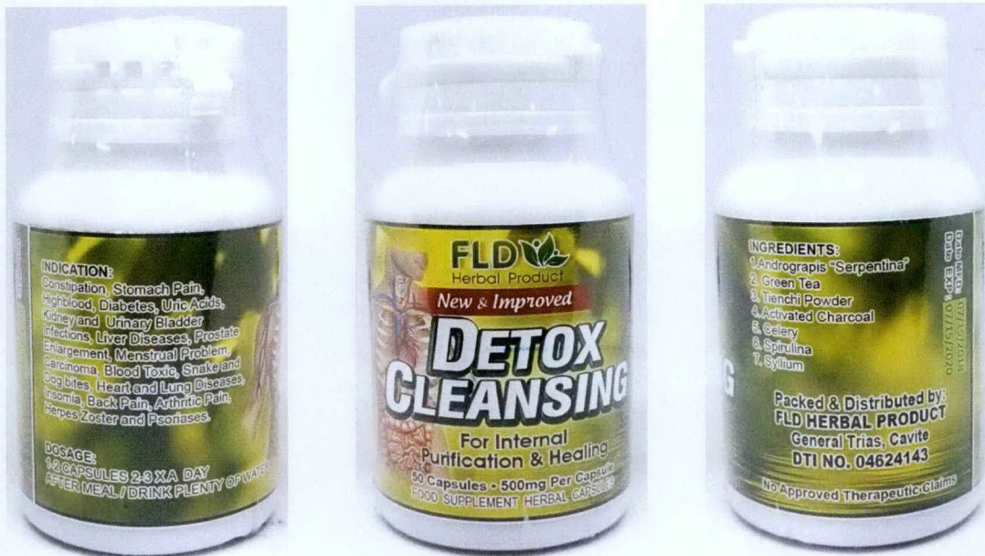
Figure 2. Unregistered FLD HERBAL PRODUCTS Detox Cleansing for Internal Purification & Healing Food Supplement Herbal Capsule