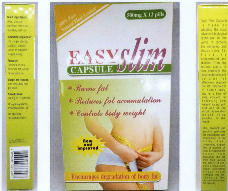
Figure 1. Unregistered Easy Slim Capsule

The Food and Drug Administration (FDA) warns the public from purchasing and consuming the following unregistered food supplements: