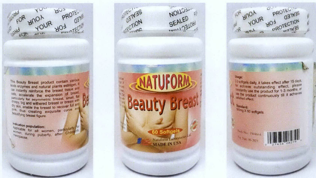
Figure 3. Unregistered NATUFORM Beauty Breast Softgels