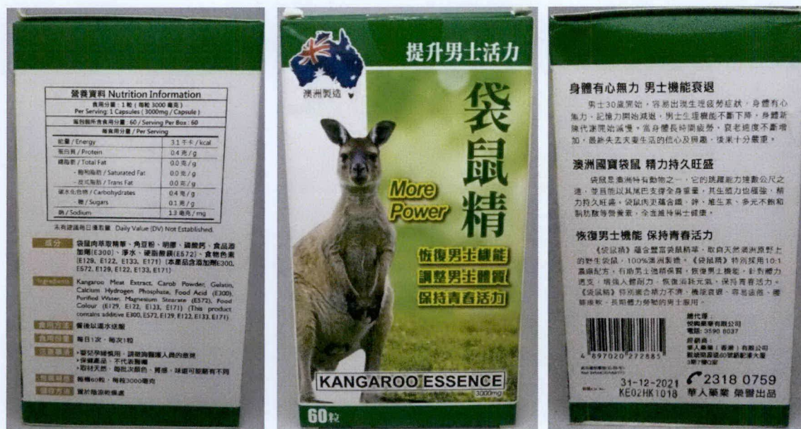
Figure 3. Unregistered Kangaroo Essence 3000 mg Capsules