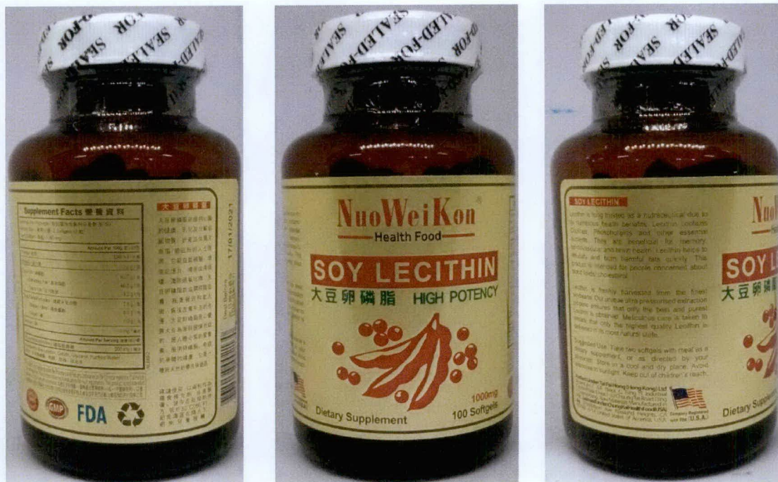
Figure 2. Unregistered NUOWEIKON Soy Lecithin Dietary Supplement Softgels