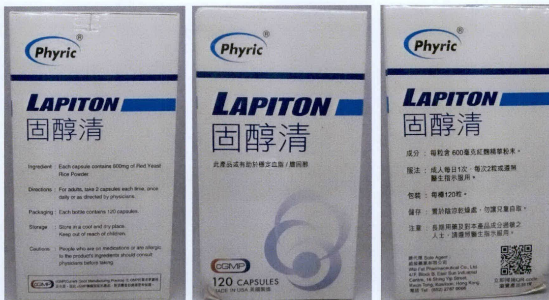
Figure 4. Unregistered PHYRIC Lapiton Capsules

The FDA verified through post-marketing surveillance that the abovementioned food supplements are not authorized and the Certificates of Product Registration (CPR) have not been issued. Pursuant to the Republic Act No. 9711, otherwise known as the “Food and Drug Administration Act of 2009”, the manufacture, importation, exportation, sale, offering for sale, distribution, transfer, non-consumer use, promotion, advertising or sponsorship of health products without the proper authorization is prohibited.